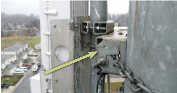
The green arrow shows the correct installation of a chain mount box. The blue arrow shows the chain mount box that failed (it was installed upside down.)