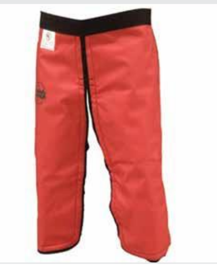
Photo shows approved chaps with ASTM tag.

This alert was developed by L&I's Division of Occupational Safety and Health (DOSH) to alert employers, labor groups, and employees to potential hazards associated with work activities. This is not a rule and creates no new legal obligations . The information provided includes suggested guidance on how to avoid workplace hazards and describes relevant mandatory safety and health rules. DOSH recommends you also check the related rules for additional requirements.