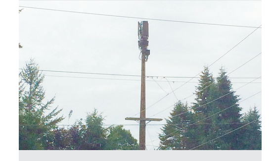
Protect workers from electrical hazards.