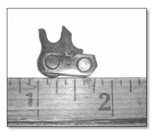
A small size but a deadly threat: chain shot from harvester or processor heads and stroker-log merchandisers or delimbers can maintain lethal velocity after penetrating 1/2-inch thick polycarbonate windshields.

Minimizing the risk for chain shot requires the combined efforts of equipment manufacturers, logging contractors, logging equipment operators, and safety professionals.