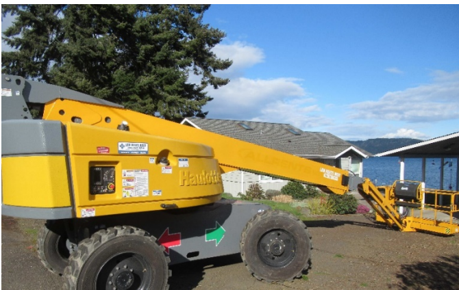
Photo 1: Incident scene driveway of residence with boom lift that workers were using to limb trees.

The job was initially contracted between the owner of the home and a logging company. That company then subcontracted the job to the employer who owned a small tree removal and landscaping company. The crew consisted of the company owner, the boom lift operator, and another worker. The three had worked together doing similar jobs in the past. According to the employer, he hired the operator because he knew he had experience operating the boom lift.