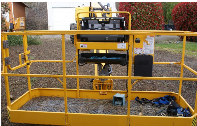
Photo 6: View of front of boom lift basket. The basket had a capacity rating for two workers or a maximum of 500 lbs.

Shortly after arriving on site, the operator and his coworker entered the basket (see photo 6). The operator controlled the boom lift from the basket and elevated it to approximately 20 feet above the ground where they could reach the lower limbs of the tree. The bottom of the basket was approximately 12 feet above the roof of the shed. They decided they needed to pull the cut branches into the basket to keep them from falling and damaging the roof of the garage and the shed. The company owner remained on the ground to operate the chipper.