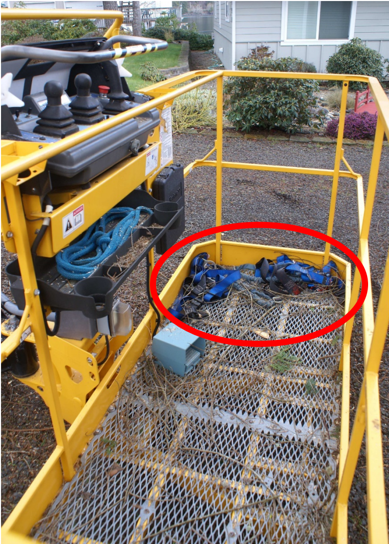
Photo 7: The two rented fall protection harnesses in the boom lift basket (circled). Also pictured are the control panel and the foot pedal that was required to be depressed in order to operate the basket.

They were wearing hard hats, safety glasses, and safety boots so there was an awareness of and attention to safety hazards. It is unknown if they were using any other safety equipment at the time of the incident. They were not wearing their fall protection harnesses even though they were in the basket (see photo 7).