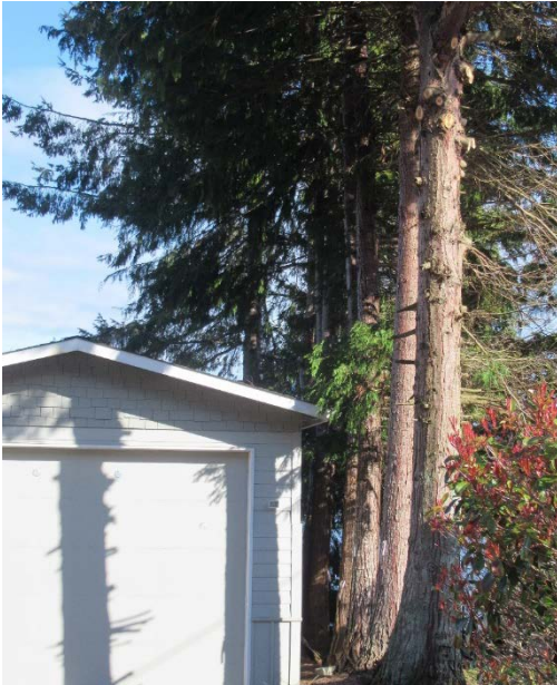
Photo 3: Incident scene garage of residence that hired the employer to remove the trees. Workers were in the process of limbing the tree on the right side of the garage in preparation to remove the tree when the operator fell from the basket.

The employer rented the boom lift, the wood chipper, and the personal fall protection gear that they needed to do the job. The boom lift was a Haulotte, model number HT67RTJO. The boom lift basket was rated for two workers or a maximum weight of 500 pounds. Their fall protection consisted of two personal fall protection harnesses and lanyards.