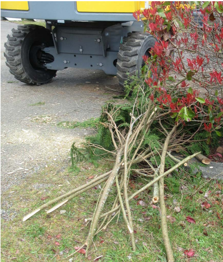
Photo 10: Some of the smaller limbs that the workers collected into the boom lift basket.

The remains of the cut limbs on the tree indicate that some of the limbs they had cut may have been several inches in diameter. This may have made the limbs difficult to bring into the basket. Some of the smaller limbs can be seen in photo 10. There is no evidence that the boom lift basket moved or shifted prior to the operator falling.