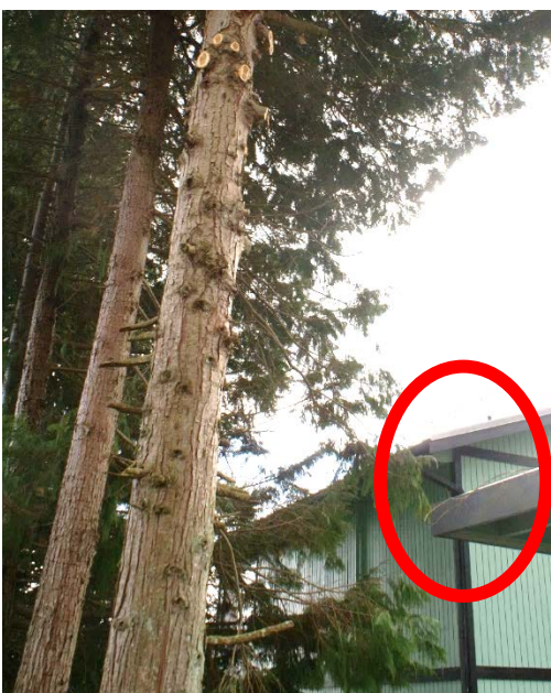
Photo 4: Tree that workers were in the process of limbing. The building on the right side of the tree is the adjacent residence. The roof of a small shed can be seen in the foreground (circled). The limb scars indicate that some of the limbs were several inches in diameter. Note the amount of space between the tree and the structures that would have allowed the crew to rig and lower cut branches to the ground.

The area where they needed to locate the boom lift basket to work was between the garage of the residence whose owner contracted the job and the home and shed of the adjacent residence. The shed was 8 feet tall and located in front of the garage (see photo 4). This meant they would need to position the boom lift basket above the garage and the shed in order to limb the trees.