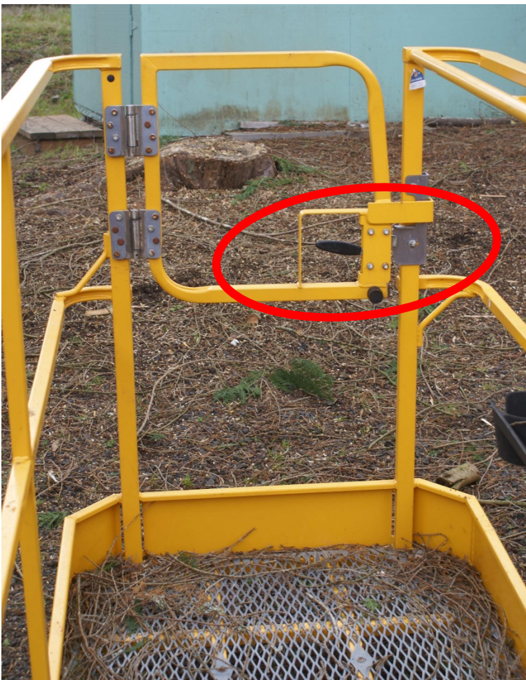
Photo 8: View of side access gate of boom lift basket. The gate had a mechanical latch (circled) and swung into the basket when opened. Note that the toe board is in place.

The coworker was cutting branches with his chainsaw while the operator was pulling the branches into the basket. They were doing this for approximately an hour. The operator opened the side access gate of the basket (see photo 8) in an attempt to get some branches into the basket. The coworker said he was reaching down to pick up his chainsaw when he saw the operator fall from the basket onto the roof of the shed 12 feet below (see photo 9). It is unknown if the operator was leaning outside of the basket and lost his balance while trying to maneuver limbs into the basket or tripped over branches in the basket or the toe board.