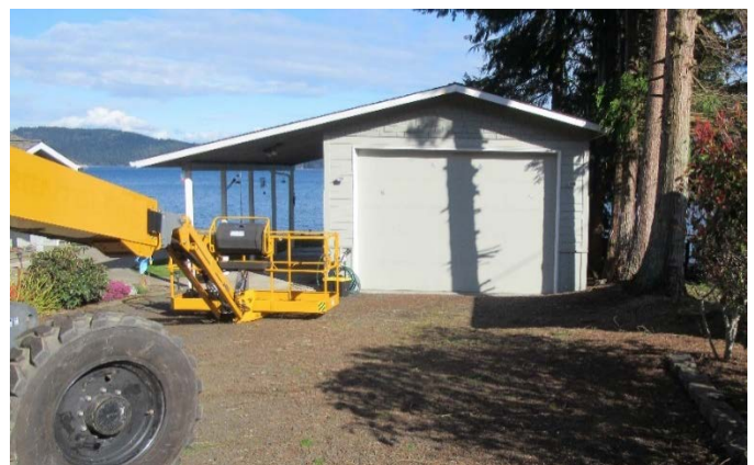
Photo 2: Incident scene driveway and garage of residence. Workers were in the boom lift basket limbing trees on the right side of the garage.