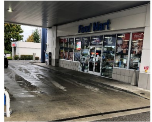
Front entrance of gas station food mart where gunman entered.

Recommendations for Workplace Violence Prevention Programs in Late-Night Retail Establishments . Occupational Safety and Health Administration (OSHA)