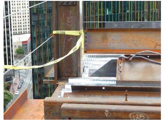
The bent plate gap the ironworker fell through. The opening was 36 inches long by 4 inches wide. Caution tape was placed after the incident.