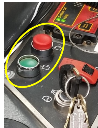
Manual system on and off buttons.