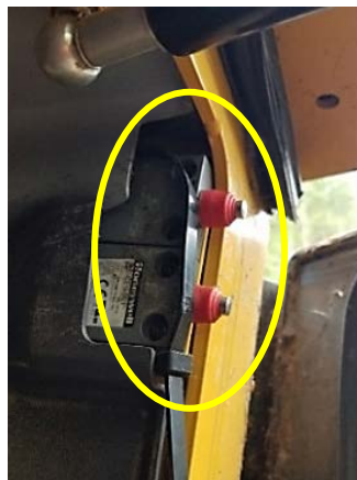
Buttons released as designed when cab door is open.