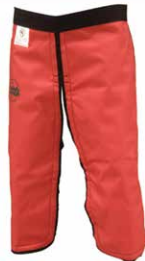
Photo shows approved chaps with ASTM tag.