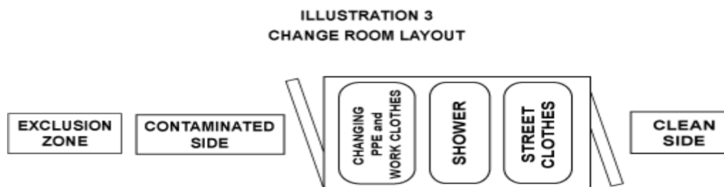
Illustration 3 is a sample diagram of a change room layout.

[Statutory Authority: RCW 49.17.010, .040, .050, .060. 18-22-116 (Order 1628), § 296-843-15010, filed 11/06/2018, effective 12/07/2018. Statutory Authority: RCW 49.17.010, .040, .050, and .060. 04-02-054 (Order 99-52), § 296-843-15010, filed 01/05/04, effective 05/01/04.]