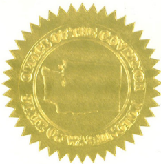
Governor Jay Inslee

A handwritten signature in blue ink, appearing to read "Jay Inslee".