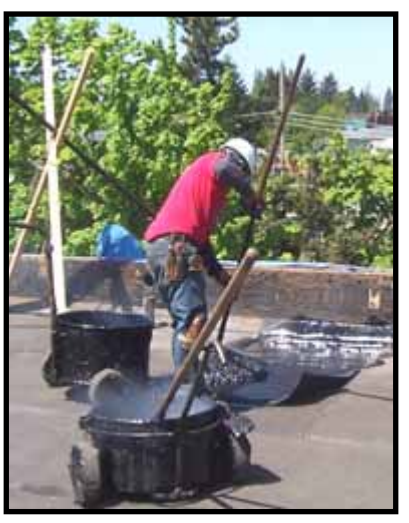
Mopping Hot Tar onto Tar Paper

Worker 1: A roofing apprentice was filling buckets with hot tar and transferring them to other roofers. Tar splashed in his face, causing him to knock over a bucket of hot tar. He then slipped in the tar and fell hands down in it. He was wearing gloves. He sustained partial thickness burns to his wrists, face, and eyes.