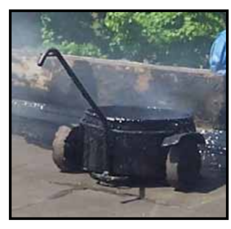
Transferring hot tar with mop carts is safer than using hand-held buckets.