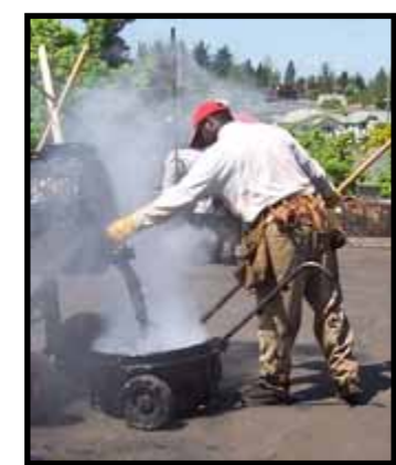
Transferring Tar from Hot Lugger to Mop Cart