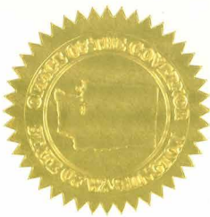
Governor Jay Inslee

A handwritten signature in blue ink that reads "Jay Inslee".