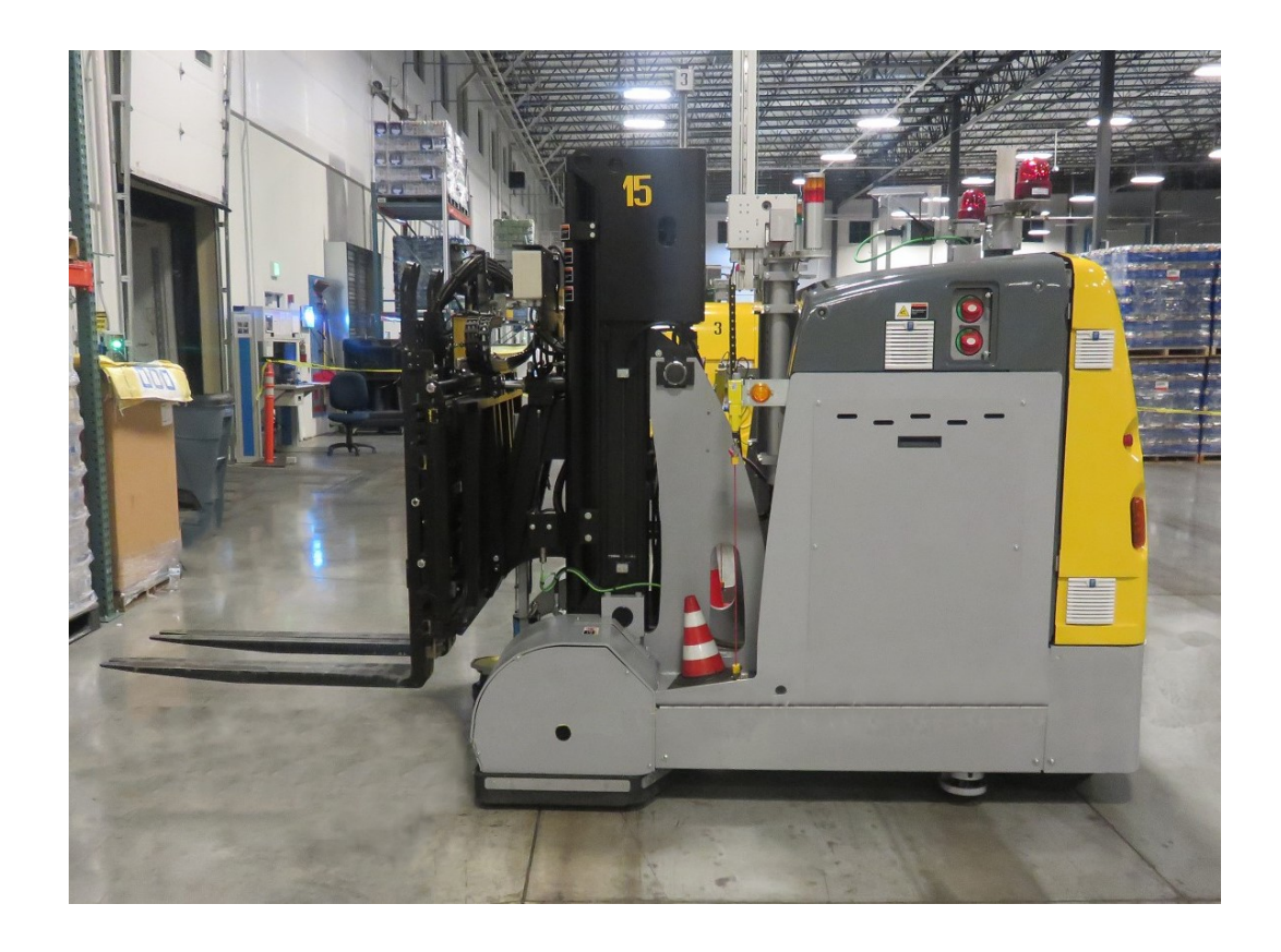
Photo of the automatic laser guided vehicle (LGV) involved in the incident.