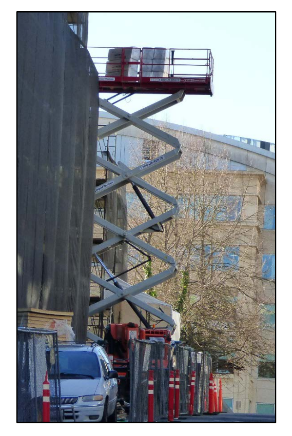
Photo 1. Incident scene showing scissor lift with platform elevated to the sixth floor of an apartment building under construction.