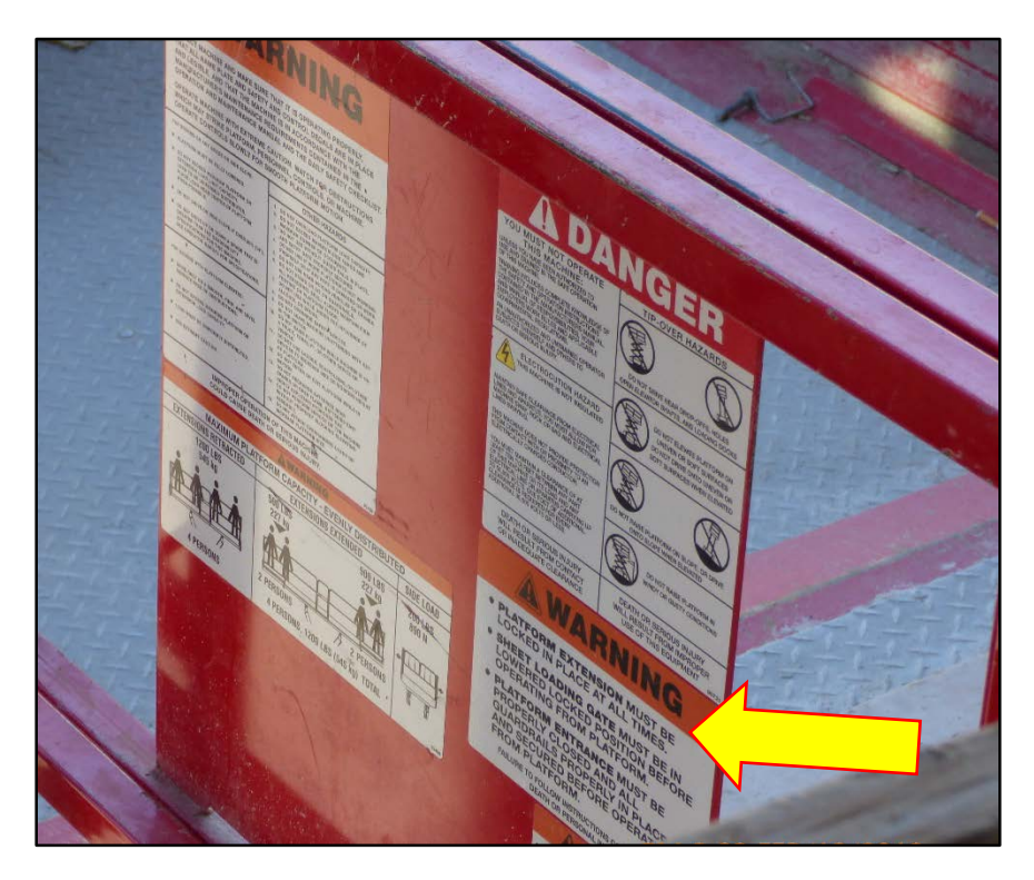
Photo 6. Scissor lift manufacturer's warnings. The arrow points to the warning: "PLATFORM EXTENSION MUST BE LOCKED IN PLACE AT ALL TIMES."