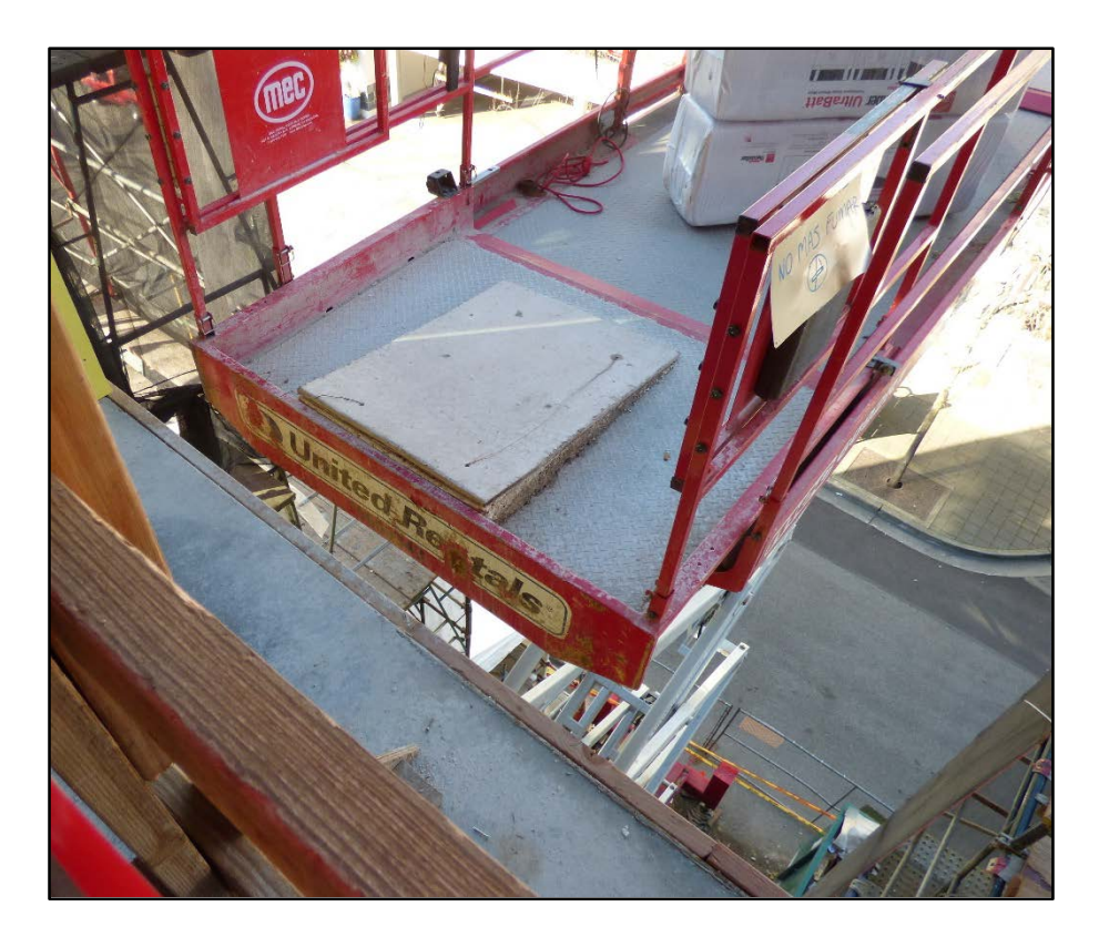
Photo 2. Incident scissor lift showing the gap between the lift and the building through which the laborer fell 60 feet.