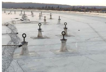
Library rooftop anchor points. The window cleaner did not use any of these.