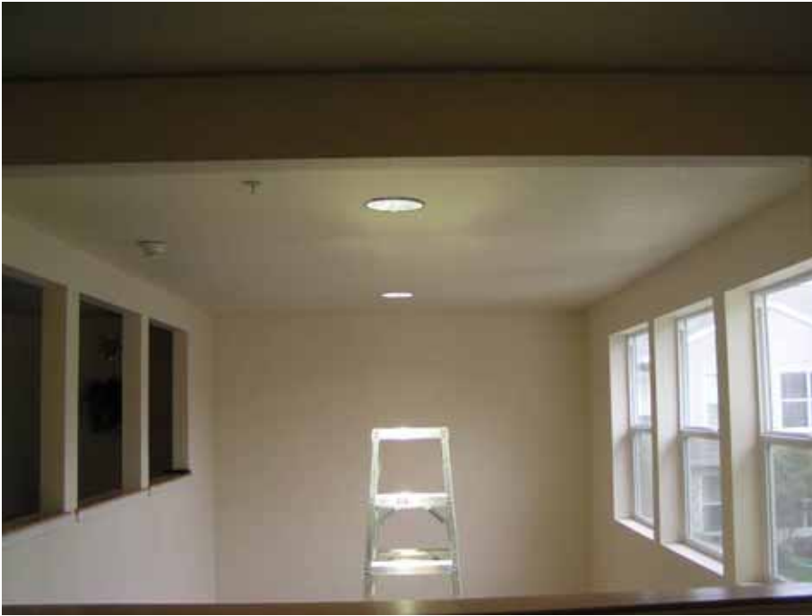
Photo 1: The assisted living facility common sitting area. The fatal incident took place in the ceiling above the light fixture and the ladder shown in this photo. (Note the metal ladder being used for electrical work.)