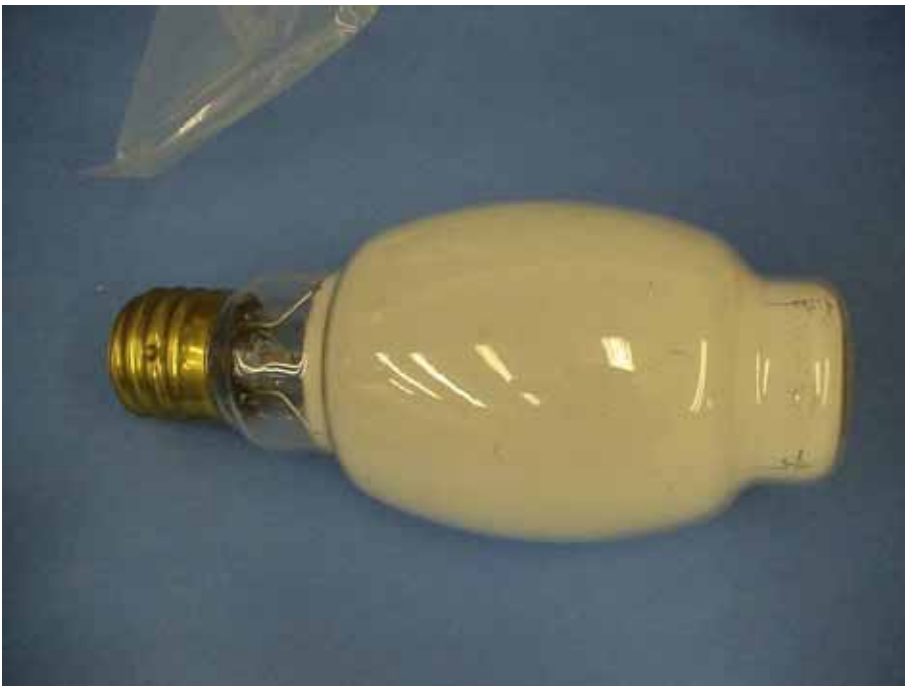
Photo 6: This photo shows a new metal halide bulb that the assisted living organization is now using at the facility. The facility no longer keeps the metal halide bulbs on site. They have an electrical contractor come into the facility to replace any metal halide bulbs that are no longer working within their emergency lighting system.