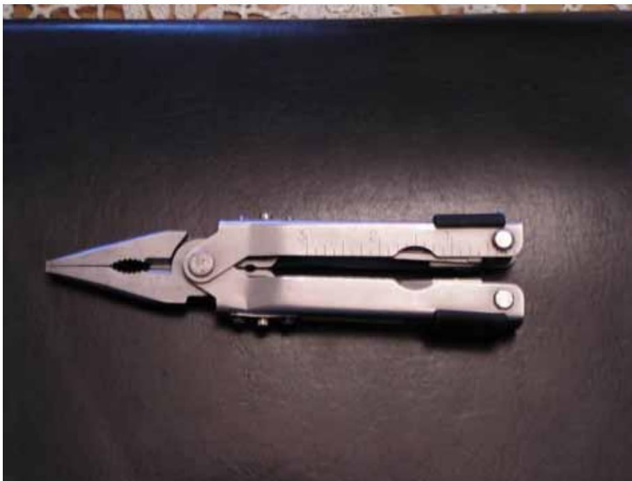
Photo 4: This photograph shows the un-insulated multi-tool used by the victim while trying to remove the broken bulb from the light fixture.