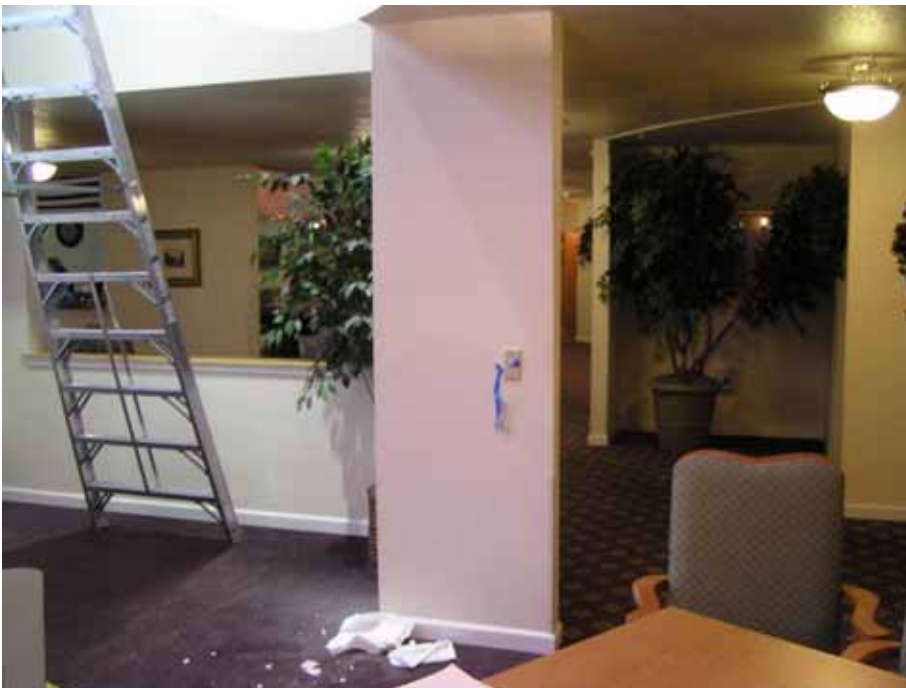
Photo 2: The photo shows the wall switch that the victim had taped in the “off “position with the hope that it shut off power to the light fixture he was working on. The ladder was used by the victim to access the attic space above the common sitting area at the assisted living facility.