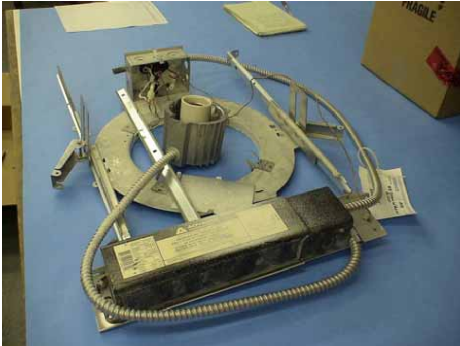
Photo 3: This photograph shows the light fixture involved in the incident after it had been removed from the assisted living facility.