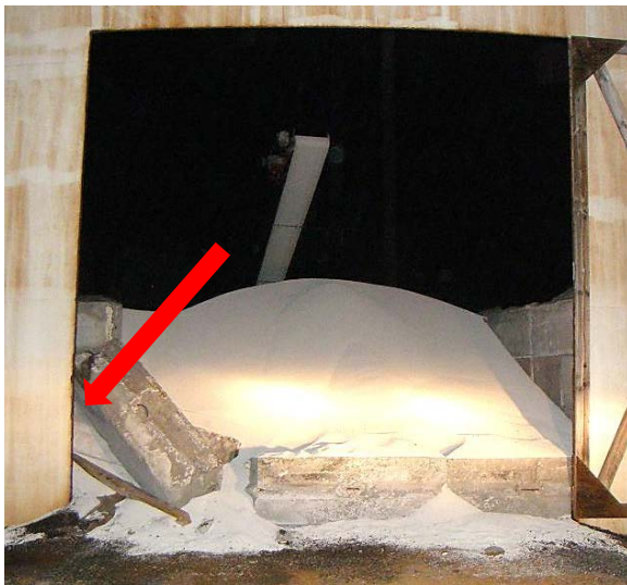
Photo 5: Arrow points to area where victim was pinned to tank wall by falling ecology block

Investigators and the employers believe that the victim saw that material was, in fact, leaking through the retaining wall and climbed down a ladder on the back wall of the storage tank to take a closer look. It appeared that he had been attempting to brace the wall with some long 2" x 6" pieces of lumber when it collapsed.