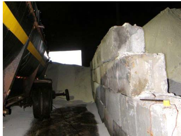
Photo 4: Ecology block wall that victim walked on top of to get to the rear of the containment bay

When the trailer had been approximately one-third of the way unloaded, the victim stopped the front end loader and left the machine. He climbed onto one of the sidewalls (photo 4) and walked on top of it toward the rear of the bay, presumably to check to see if material was leaking through the back wall. Shortly after, the victim's coworker heard several loud noises and yelled for the victim, but there was no answer. He ran to the top of the fertilizer pile and saw that blocks had fallen from the back wall. He ran to the outside of the tank. After pulling some of the fertilizer out of the way, he saw the victim pinned to the side of the storage tank wall by a fallen ecology block (photo 5). Another worker immediately called 911 and emergency responders arrived within five minutes. The victim was declared dead at the scene.