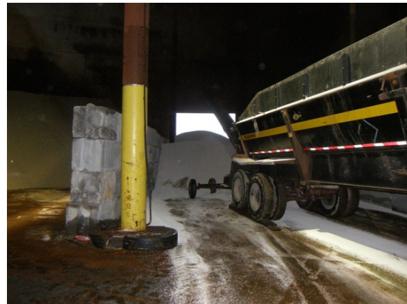
Photo 3: Semi-trailer and "piler" positioned to unload product in the storage tank containment bay

At approximately 5:00 p.m. on the day of the incident, the victim and another worker were in a large steel storage tank unloading a semi-truck trailer of granular bulk fertilizer into a containment bay partitioned by retaining walls assembled using concrete ecology blocks stacked four high. Each trailer contained approximately 25 tons of fertilizer. It was the last truck of the day; two trailers had already been unloaded into the containment area. The trailer had been backed into the containment area (photo 3) and connected to a mobile conveyer belt, or piler, operated by the victim's coworker. Fertilizer was offloaded from the trailer onto the piler, which would drop the fertilizer into the containment bay. The victim was operating a front end loader. As the fertilizer dropped from the conveyer into a pile, the victim would periodically use the front end loader to push the material further into the