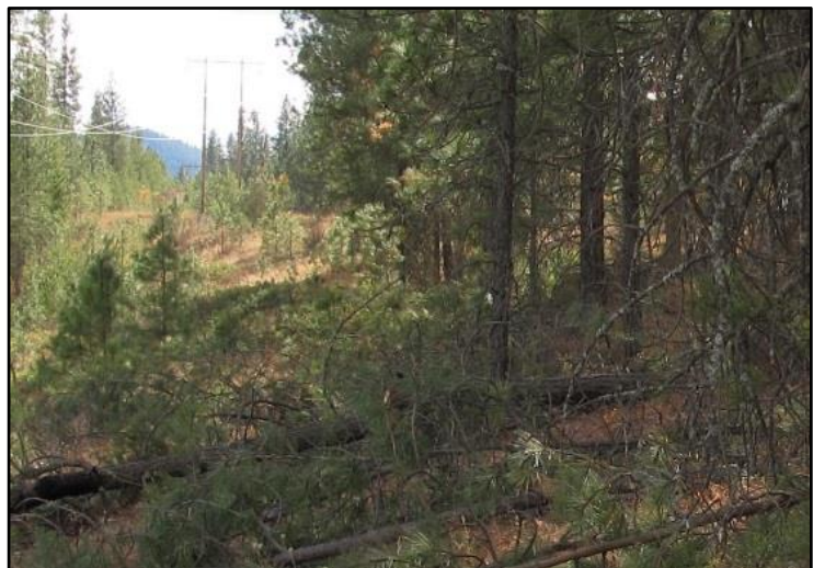
Photo 2: Tree felled by victim, showing stand of trees and power lines.

The victim was working falling trees within the stand adjacent to the road at the top of the slope (photo 2). His partner was working with his back to the victim, bucking the trees felled by the victim into smaller pieces. After finishing cutting one tree into sections, the victim's partner turned and noticed the top of a