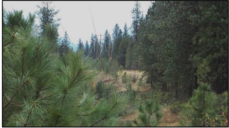
Photo 1: North to South view of stand of trees where victim was working and proximity to power lines.

The incident occurred on state-owned forest land between a rural road and a 60-foot power transmission right-of-way. The site was part of a unit where the crew had been performing pre-commercial tree thinning operations, and consisted mostly of Western Larch, Douglas Fir and Ponderosa Pine species. Part of the timber stand was at the top of a slope bordering the road (photo 1). The three 115,000-volt transmission lines ran along the base of the slope. It was approximately 45 feet from the tree line to the nearest power line (figure 1).