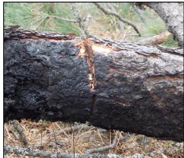
Photo 4: Top and bottom cuts on tree at location where electrocution occurred

Investigators later found that the victim had made one cut without incident through the tree approximately 11 feet from the base of the tree in his attempt to remove the tree from the power line. When the tree remained hung-up after this cut, he moved 9 feet further up the trunk and made cuts to the top and bottom of the tree (photo 4). It was as he was making one of these cuts that the tree became energized and created a path to ground through the victim.