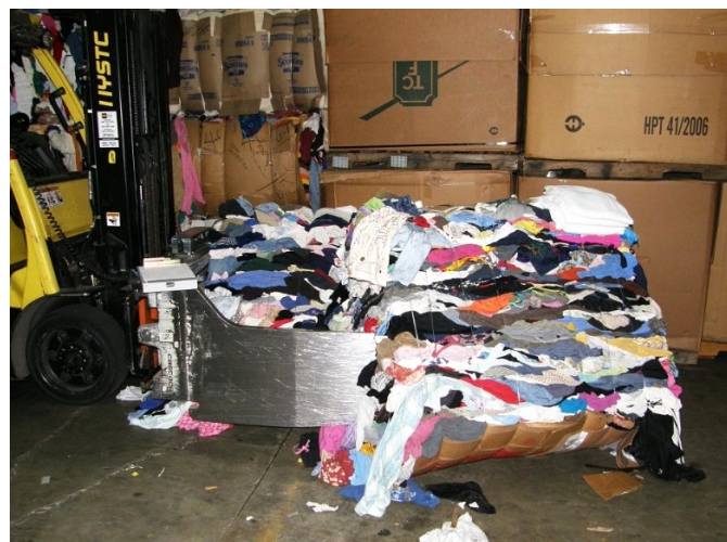
Photo 7: The two bales of used clothing that fell on the victim, shown in the bale clamps of the forklift.