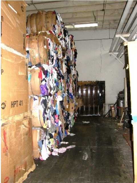
Photo 5: Inside the warehouse showing stacked bales of clothing and boxes of used personal items. The photo shows a pedestrian and forklift traffic area used to access to a loading dock and other parts of the warehouse.