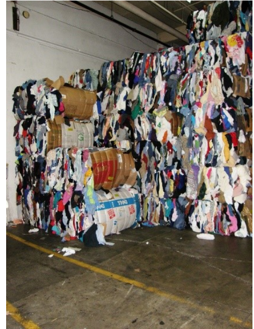
Photo 6: The method that company forklift operators used to store clothing bales in the warehouse was to begin by placing bales against a wall and then stack other bales on top and then place others to form rows to create stable storage.