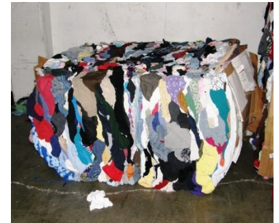
Photo 1: A typical bale of used clothing weighing approximately 730–750 pounds and measuring approximately 48 by 24 by 60 inches.

Investigators for the Washington State Division of Occupational Safety and Health (DOSH) and WA FACE investigators were unable to determine why the stacked bales fell. During the DOSH investigation, the incident forklift operator and the two other company forklift operators were interviewed. The incident forklift operator stated that the incident bales were baled before they arrived at the warehouse. Bales are secured with either metal straps or twine. Like all arriving bales they were weighed and visually assessed for integrity. The incident bales appeared to him to be well constructed