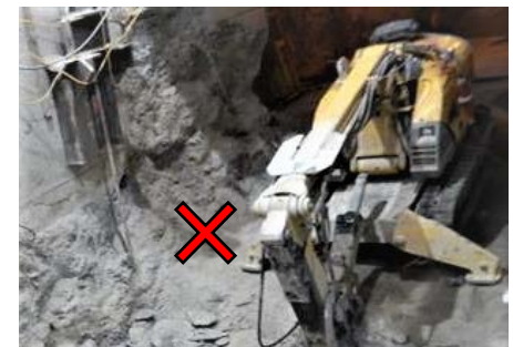
Photo 2: Machine and approximate location of operator (Indicated by red "X").