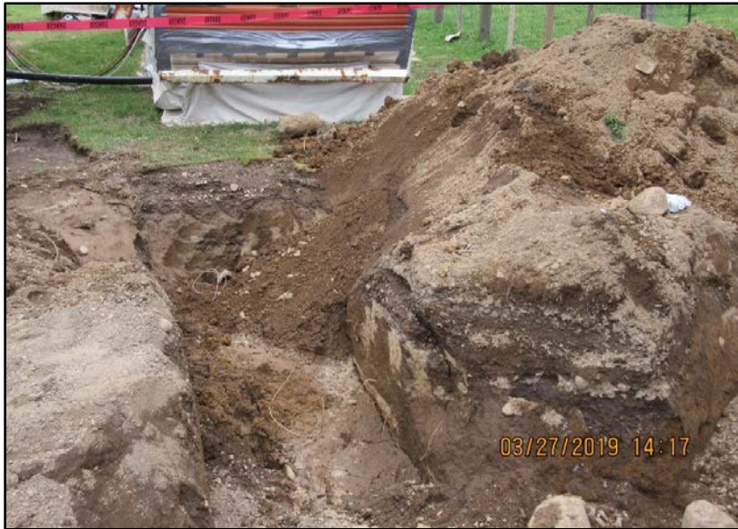
Photo 4. Spoils piles sloughing into the trench.