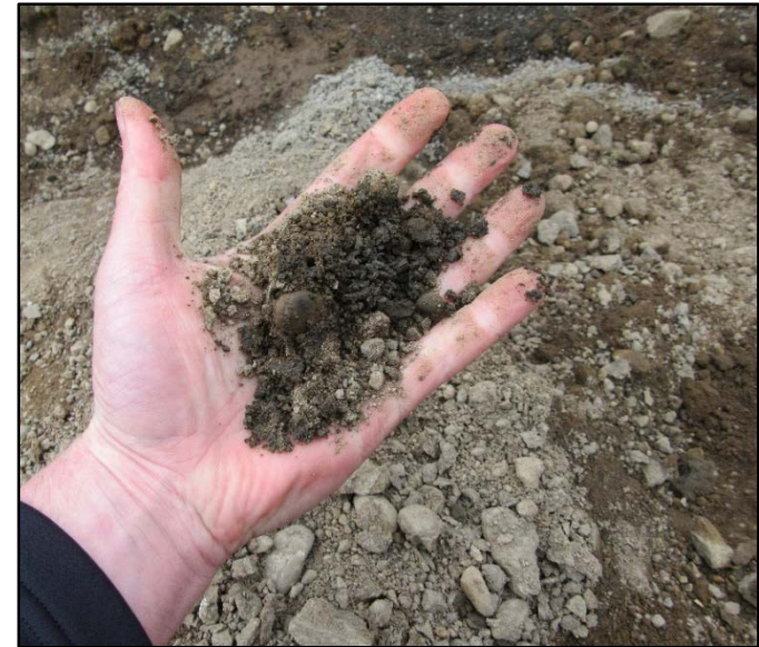
Photo 5. Type C soil material taken from the sidewall of the excavated trench.