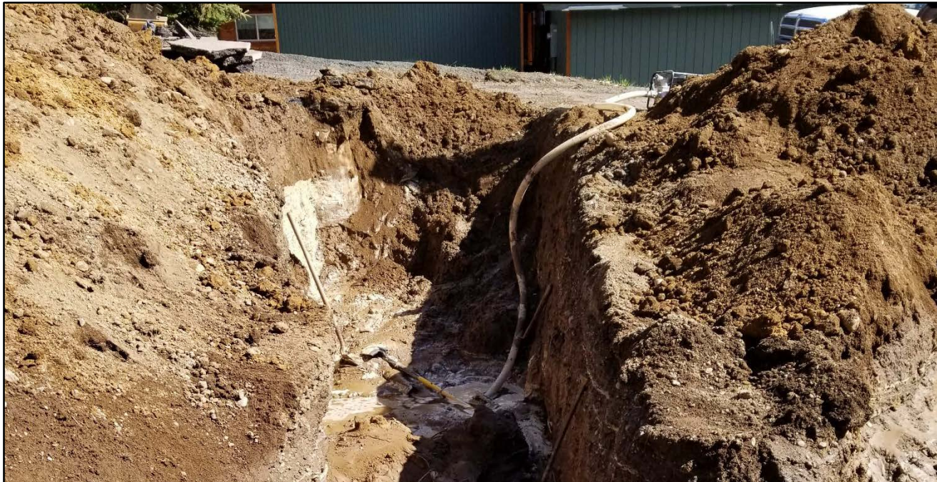
Photo 6. The workers did not use a safe means of entering and exiting the trench which was more than four feet in depth. The workers got in and out in this area at the far end of the trench.