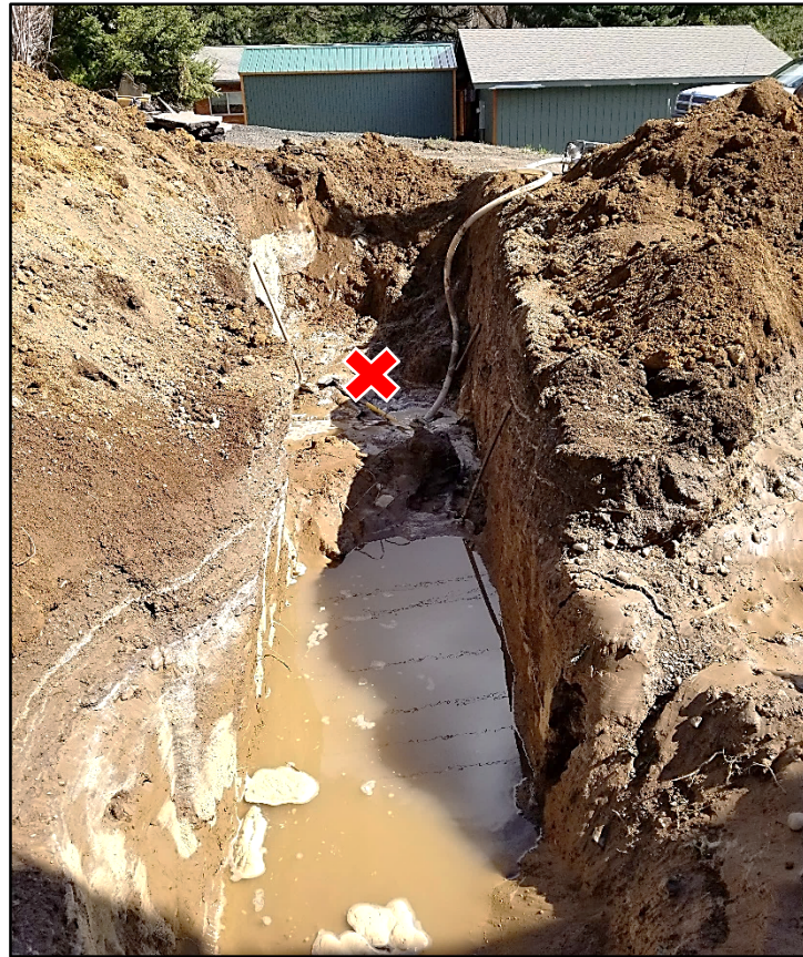
Photo 2. The “x” indicates the laborer’s location. The water in the trench came from the water main that was ruptured by the excavator the laborer’s coworker was using in an attempt to dig him out after the trench wall sluffed onto him.