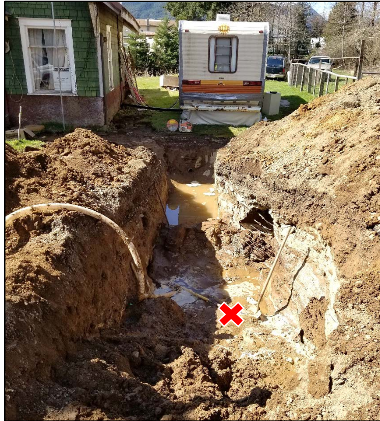
Photo 1. Unprotected trench after a part of its sidewall collapsed, partially burying the laborer. The “x” indicates the laborer’s location.