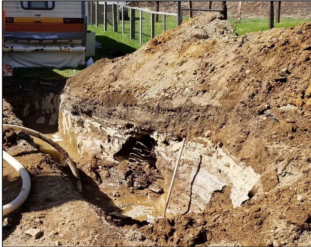
Photo 3. The area where the laborer was using a shovel to uncover a water main when the trench sidewall sluffed into the trench, partially burying him. The spoils piles were not set back the required two feet from the trench edge.