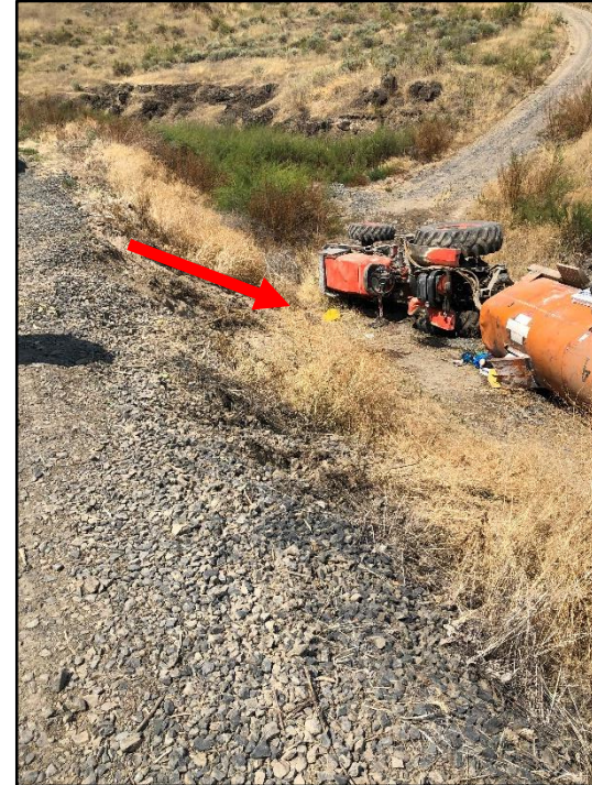
Photo 2 & 3. Approximate path of the tractor as it exited the row of apple trees, went along the service road, and where its front right tire went over the side of the embankment, causing the tractor to roll down the 6-foot embankment. Note the loose gravel and unclear border between road and embankment.