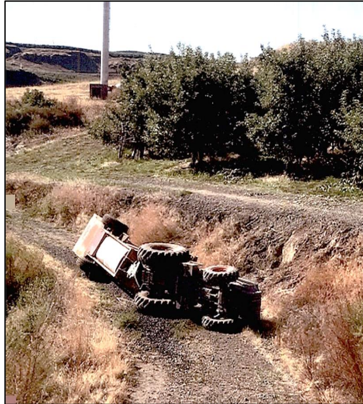
Photo 1. Overturned tractor with sprayer at bottom of embankment.