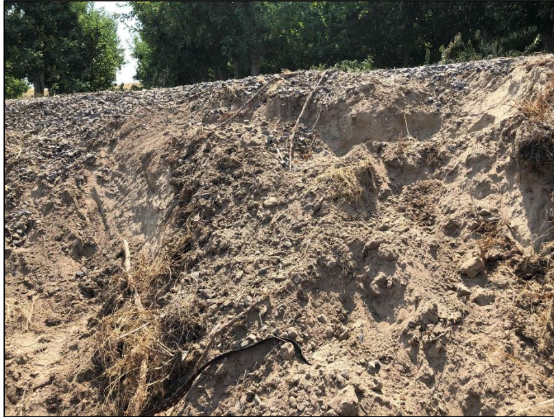
Photo 4. The area of the embankment that crumbled under the tractor's weight.