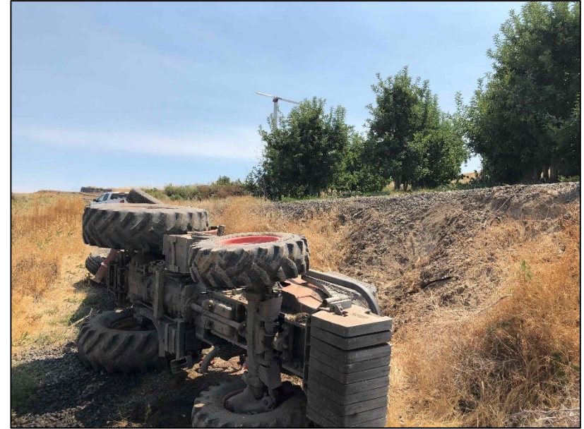
Photo 5. The overturned tractor and sprayer at the bottom of the 6-foot embankment.