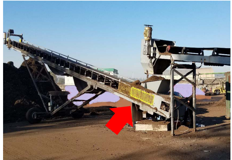
Photos 2 and 3: Left photo shows front side view of radial stacker conveyor involved in the incident. Right photo shows rear side view of stacker. Red arrows show the conveyor's tail end location where the lead screen plant operator was pulled in between the return idler roller and conveyor belt.

The stacker's safety features included an emergency stop (E-Stop) located in a central control panel shed and a plastic guard that partially covered the return idler roller to prevent someone from being drawn between the roller and belt. Only mechanics were allowed to remove the guard, which they could do by lightly tapping it out of its holding brackets with a hammer. Warning stickers were applied on the guard (photo 4). The stacker manufacturer provided a parts manual to the employer but did not publish safety instructions or a user's manual for custom-built machines such as this one.