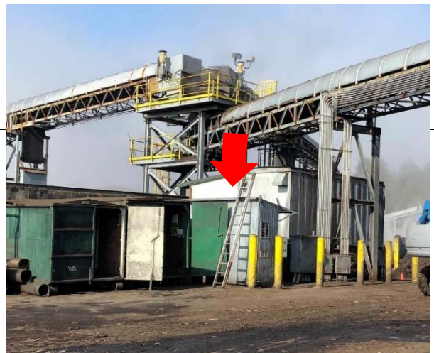
Photos 6 and 7: Red arrow in left photo shows central control panel shed location, and the blue arrow shows incident location approximately 70 feet away. Red arrow in right photo shows close up of central control panel shed.