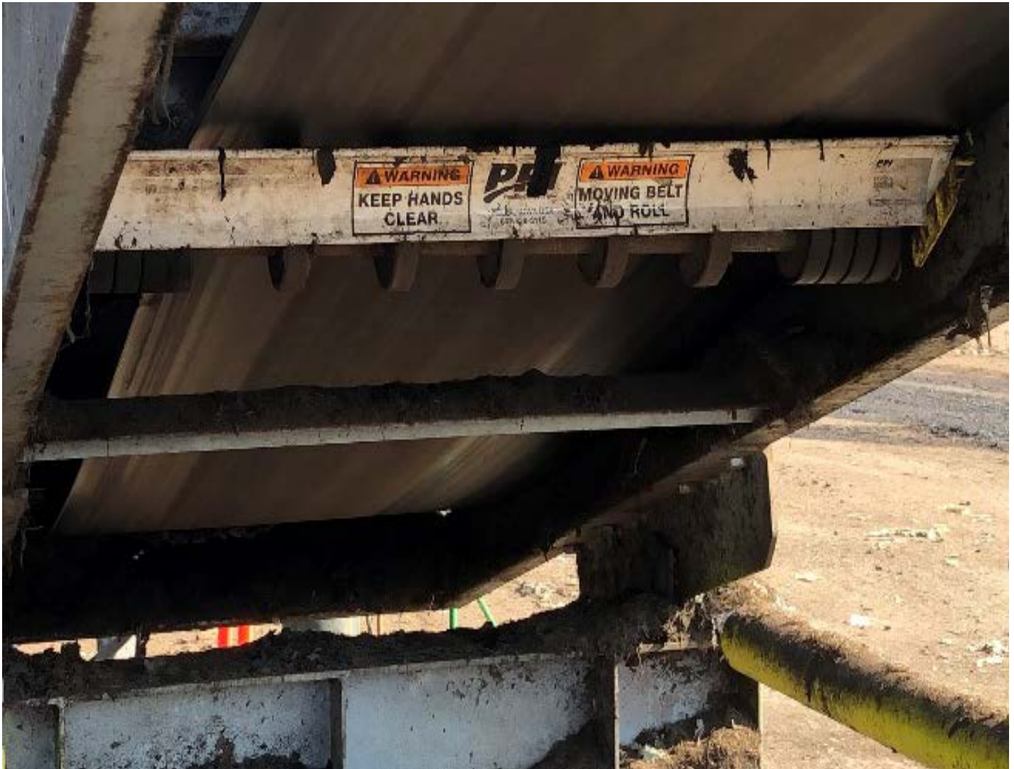
Photo 4: Plastic guard with warning signs that was missing on the return idler roller on the radial stacker conveyor involved in the incident. The photo also shows a rubberized disk idler roller that replaced the steel roller involved in the incident. Disk rollers help minimize material build-up and the need for frequent cleaning.

The employer's LOTO requirement procedure was not specifically designed for the stacker but presented general steps to shut down a machine, deactivate and lock out the energy isolating device, dissipate or restrain stored or residual energy, and disconnect the machine from the energy source. The plant's LOTO station was kept in the operations trailer that was 75 feet from the incident location (photo 5). The stacker's main power switch and E-Stop were located in a central control panel shed near the center of the plant about 70 feet away from the incident location (photos 6 - 10). During LOTO for cleaning, workers used rakes, shovels, metal spade scrapers, and water trucks with hoses to remove hard material that was stuck on the machine.