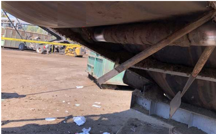
Photo 11: Conveyor belt and unguarded steel return idler roller with metal spade scraper tool that was pressed against the lead operator's throat. Responding workers cut the belt and broke the tool's wooden handle to release the operator. Photo taken after incident.

The compliance safety and health officer's (CSHO) incident investigation found that the return roller's plastic guard was missing. During interviews by the CSHO, other screen plant workers could not indicate how long the guard was missing or where it was located. Plant supervisors speculated that the lead may have been pulled into the conveyor by his sweatshirt hood or the scraper handle, if he was using it to clean debris off the roller. The stacker shut down because an amperage spike tripped its conveyor motor's protection switch when the lead became caught in the machine.