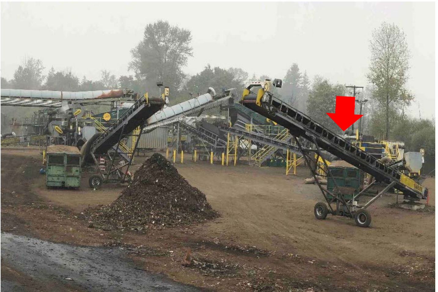
Photo 1: Biomass screening system equipment in screen plant where worker was fatality injured. Red arrow indicates radial stacker conveyor involved in the incident.

Administration (MSHA). The stacker manufacturer used the employer's hourly stockpile production rate goals to select the machine's conveyor belt, drive motor, and gearbox. The stacker involved in the incident featured a 64-foot long by 36-inch wide by ¾-inch thick rubberized flat conveyor belt (photos 2 and 3). The belt was looped and suspended around head and tail pulleys at both ends of the conveyor frame and driven by a motor at the head pulley. Several rotating steel idler rollers supported the belt along its length. The return roller involved in the incident was located closest to the tail pulley and was 4-feet 6-inches above the ground. The stacker frame rested on a single axle undercarriage with single swivel wheels at opposite ends that allowed it to be moved. Processed compost was loaded from a chute onto the tail end of the conveyor belt that carried it up to the head end where it discharged into a stockpile.