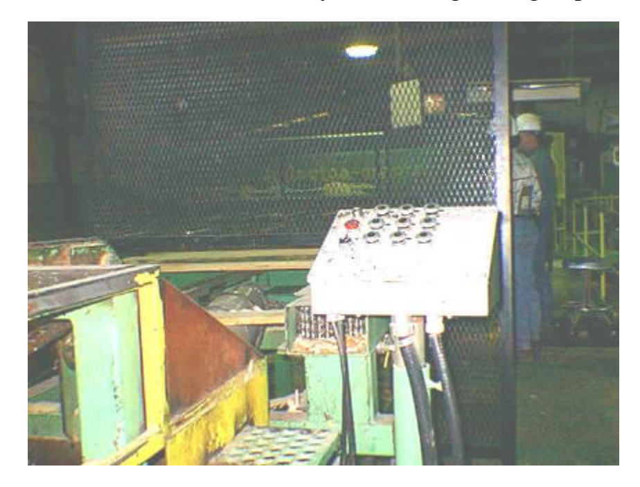
Photo #1. "Unscrambler" operator's workstation - facing "trimsaw" operators work station and trimsaw system. New guarding in place.