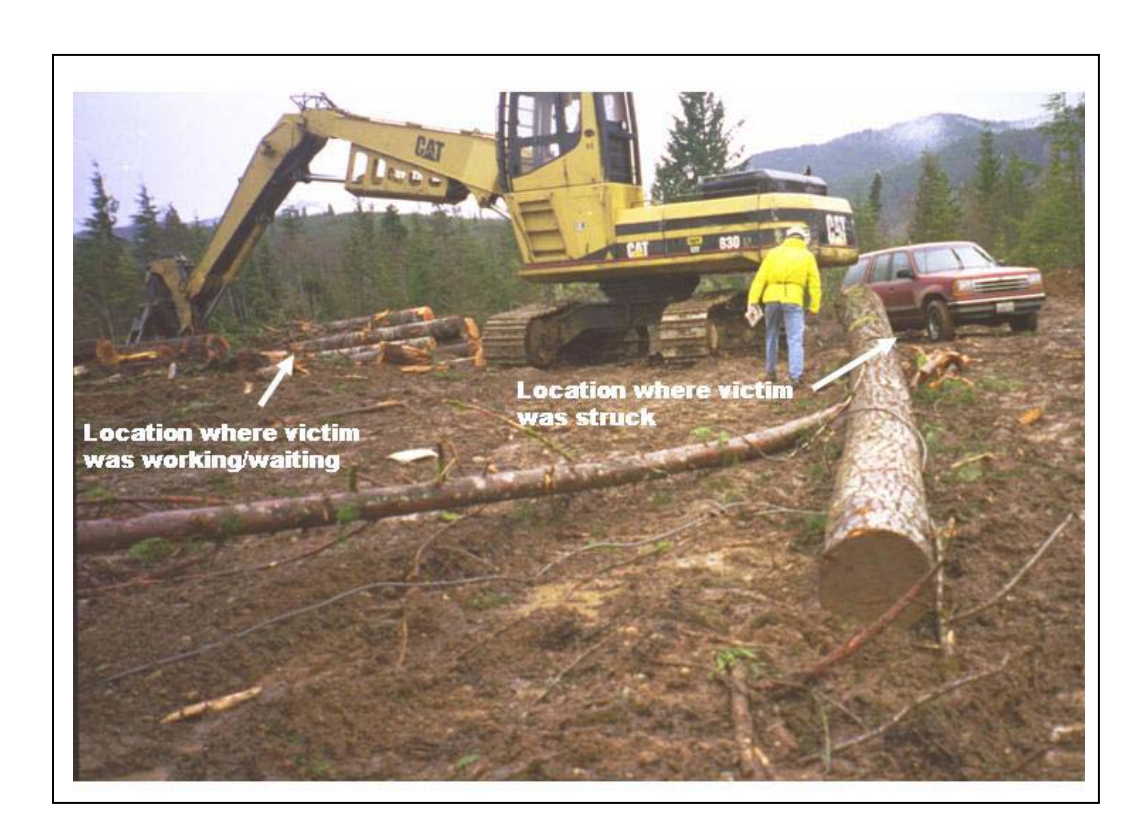
Photograph 3 The event site and log that struck the worker.