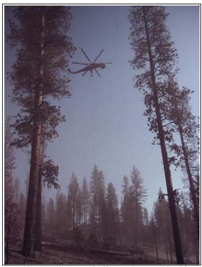
Photograph 1 Helicopter similar to that used in this event.