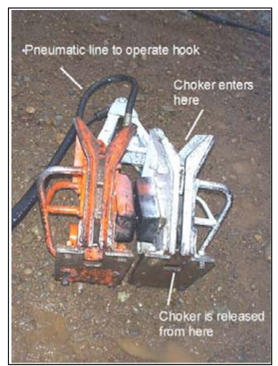
Photograph 2 The hook used in the fatal event.