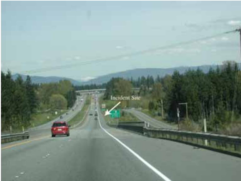
Photo 1: The view traveling down the highway east toward the incident site. The incident occurred at the bottom of the hill on the right shoulder.