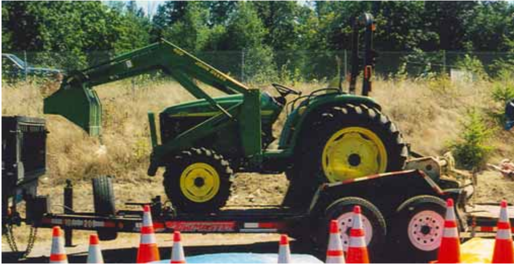
Photo 3: This photograph shows the tractor and mower attachment that were in the process of being tied-down to the trailer when the incident occurred.