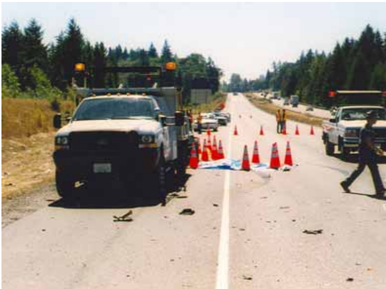
Photo 2: The incident scene after emergency response, facing west, looking up the hill toward on-coming traffic.