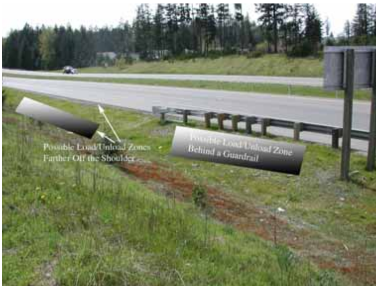
Photo 4: This figure shows several additional options, just beyond the site of the incident, for parking a trailer to load/unload that might provide better protection than the shoulder.