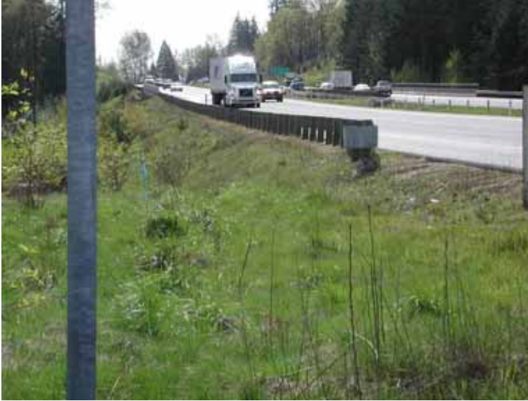
Photo 5: This photograph shows another possible site at the bottom of the hill, just before the incident site, where a trailer might be able to load/unload if feasible. This site would give good protection, behind a guardrail.