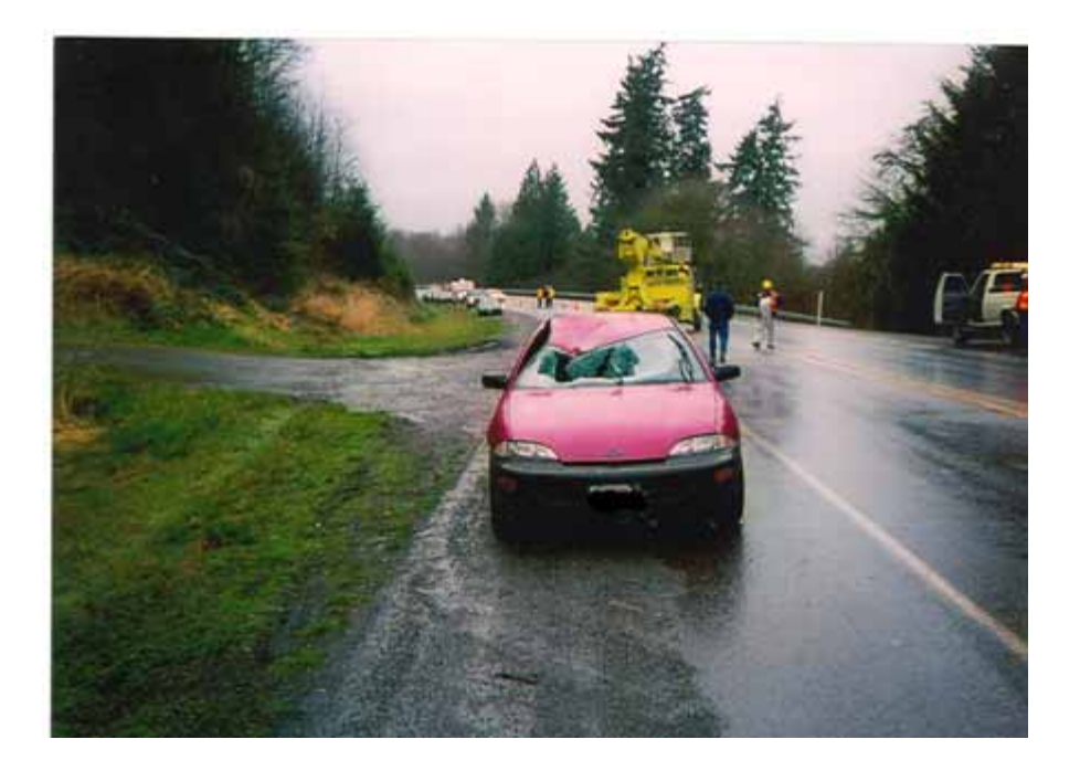
Photo 4: Shows the vehicle involved in the incident looking west along the shoulder of the eastbound lane.