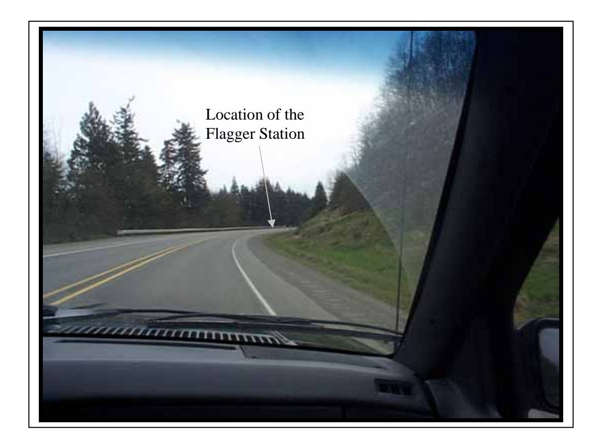
Photo 2: Shows the FACE Investigation vehicle traveling eastbound toward the flagger station and work zone during post incident FACE investigation.