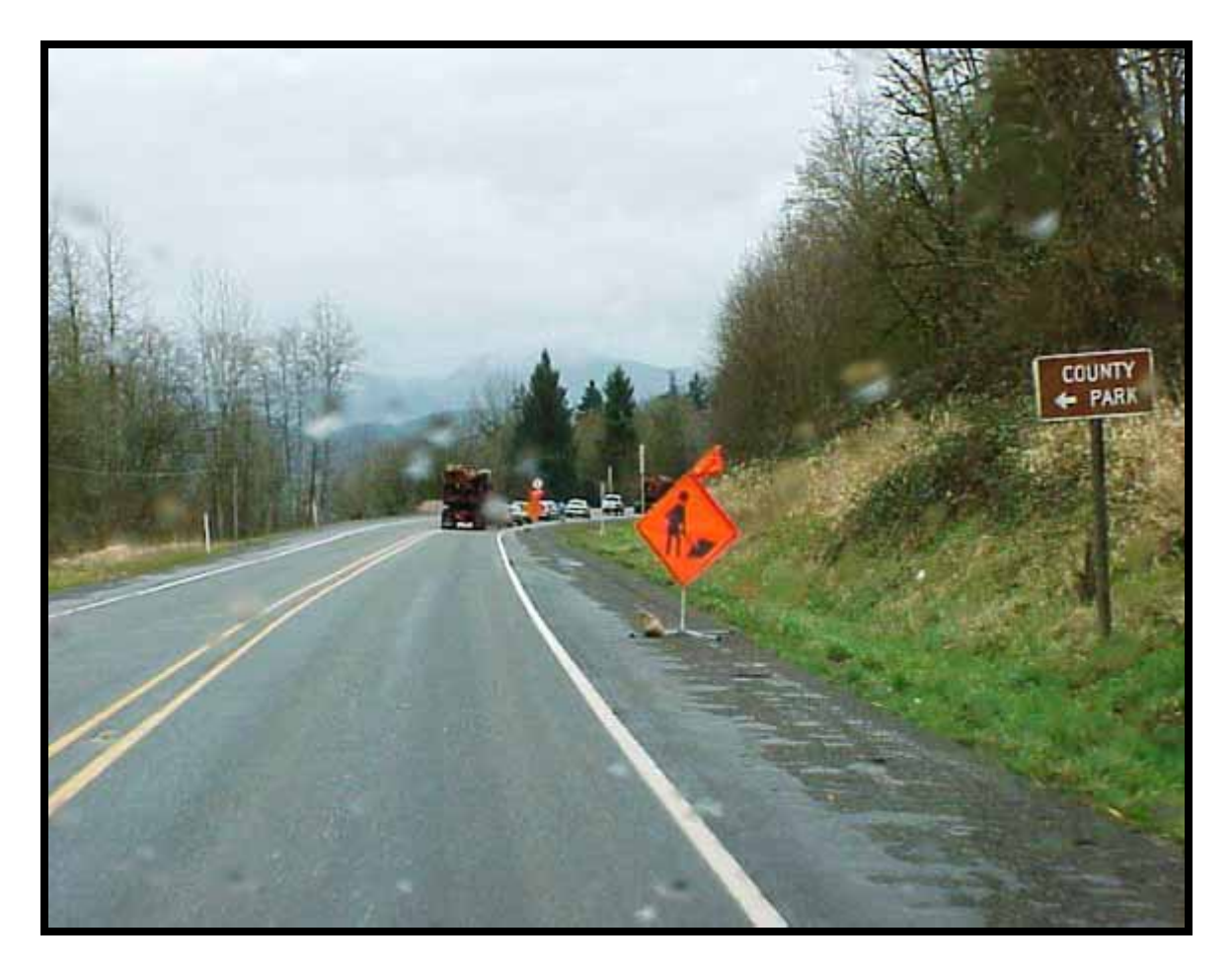
Photo 1: Shows work zone signs traveling eastbound heading toward the incident site which is just beyond the curve on the highway.