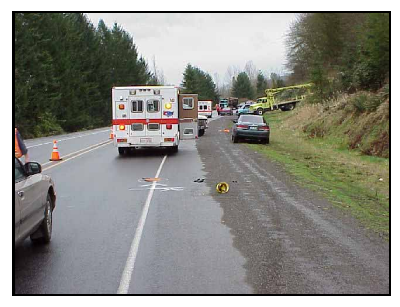
Photo 3: Shows the incident site looking east on the eastbound traffic lane and the shoulder of the highway.