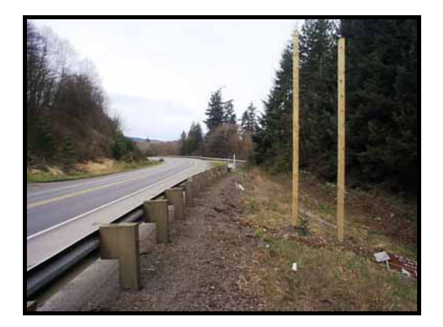
Photo 5: <u> BEFORE </u>– Shows the work zone site during 1st post-incident FACE investigation site visit, prior to fill, rock and gravel being brought in to augment the sign installation. Looking west along the eastbound lane of highway.