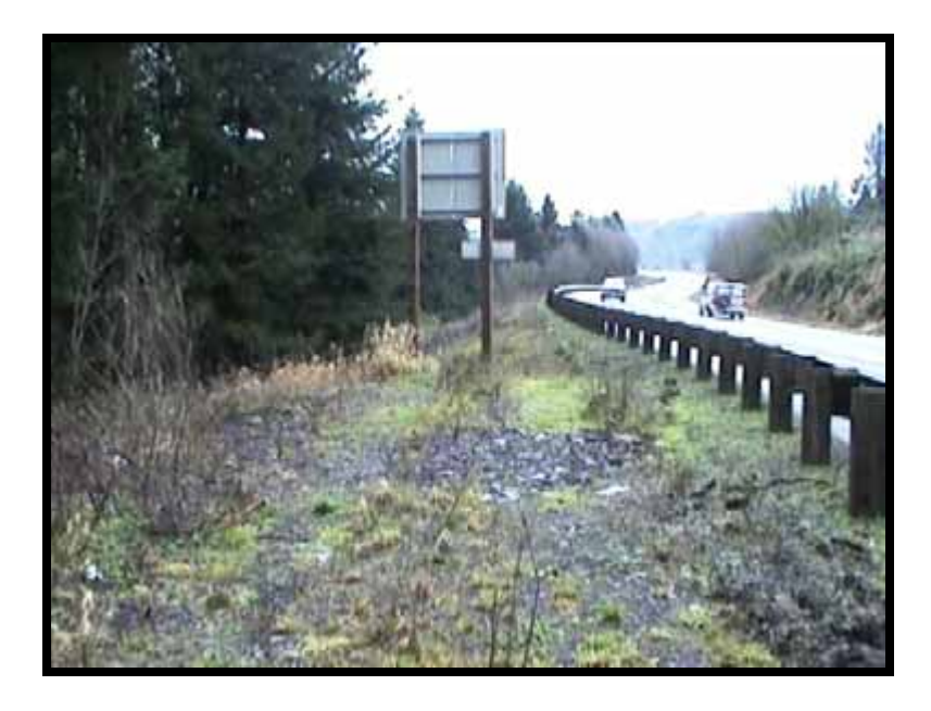
Photo 6: <u>AFTER</u>– Shows the work zone site during 2nd post-incident FACE investigation site visit, and after fill, rock and gravel had been brought in so sign installation could be completed off the roadway without impacting highway traffic. This view is looking east along the westbound lane of highway.