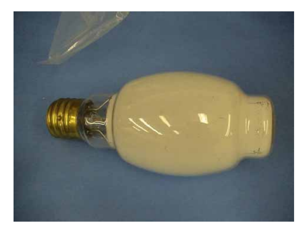
Photo 6: This photo shows a new metal halide bulb that the assisted living organization is now using at the facility. The facility no longer keeps the metal halide bulbs on site. They have an electrical contractor come into the facility to replace any metal halide bulbs that are no longer working within their emergency lighting system.