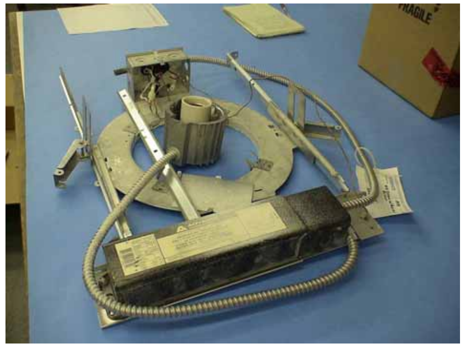
Photo 3: This photograph shows the light fixture involved in the incident after it had been removed from the assisted living facility.