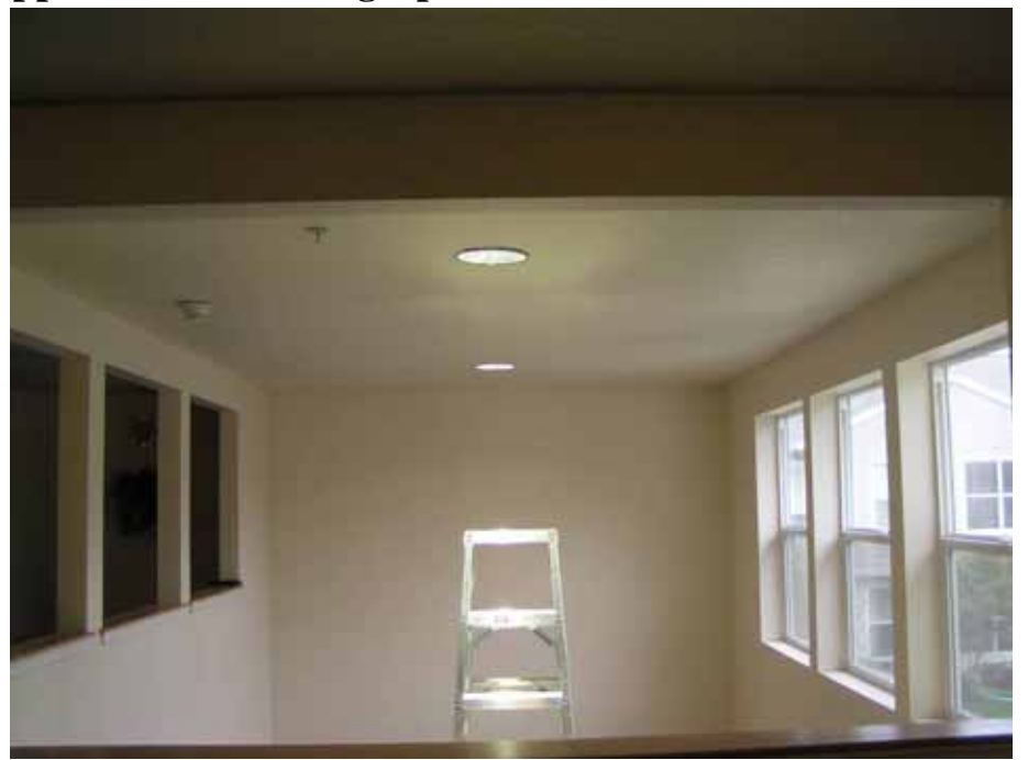
Photo 1: The assisted living facility common sitting area. The fatal incident took place in the ceiling above the light fixture and the ladder shown in this photo. (Note the metal ladder being used for electrical work.)