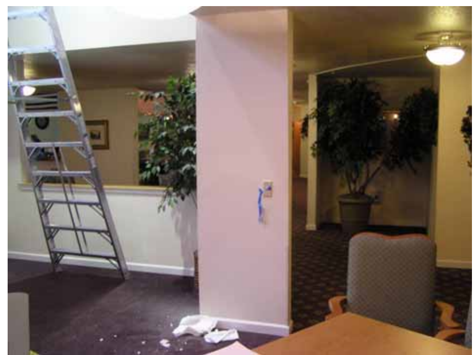
Photo 2: The photo shows the wall switch that the victim had taped in the "off "position with the hope that it shut off power to the light fixture he was working on. The ladder was used by the victim to access the attic space above the common sitting area at the assisted living facility.

Photo 1: The assisted living facility common sitting area. The fatal incident took place in the ceiling above the light fixture and the ladder shown in this photo. (Note the metal ladder being used for electrical work.)