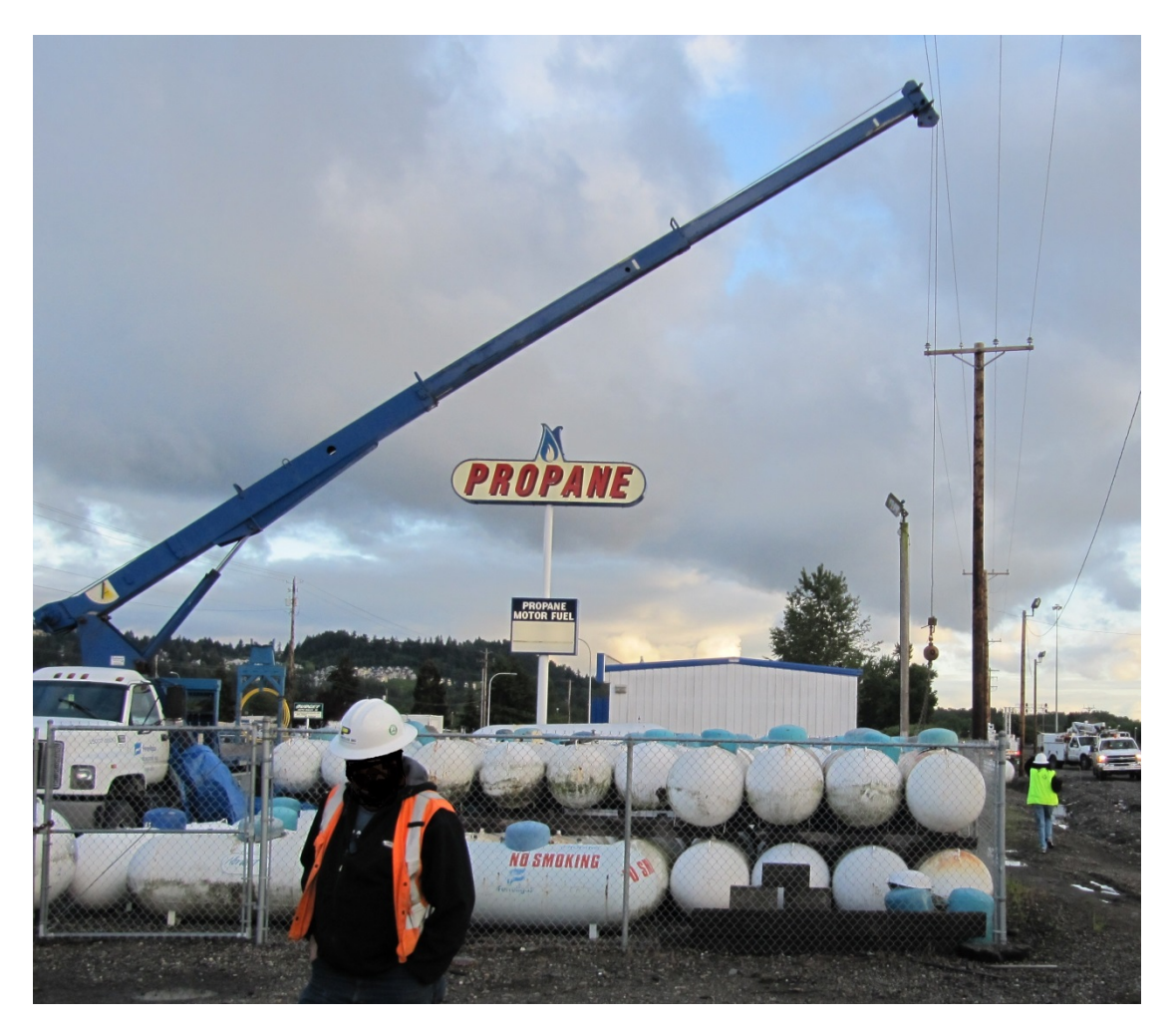
Photo 10. Crane boom tip contacting eastern phase wire of a three-phase 7,200 volt power line. The power lines were located to the west of the yard, and for a short distance inside the yard, and ran north and south. The sequence of the three-phase 7,200 volt power line wires in relationship to the crane boom is eastern phase, neutral, middle phase, and western phase.