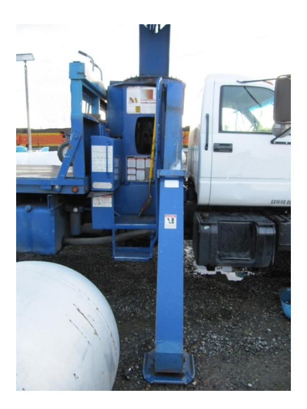
Photo 2. Crane operator's station on boom truck. Operator's stations were located on each side of the truck's chassis. This photo shows the station on the opposite side of the truck from where the service technician was standing at the time of the incident.