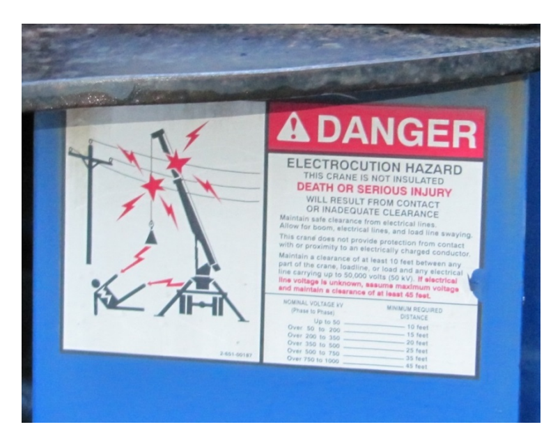
Photo 3. Safety sticker warning of electrocution hazard placed on the right side of the crane operator's station on the boom truck. There were seven such warning signs located on various parts of the boom truck.

Photo 2. Crane operator's station on boom truck. Operator's stations were located on each side of the truck's chassis. This photo shows the station on the opposite side of the truck from where the service technician was standing at the time of the incident.