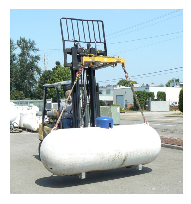
Photo 13: An alternative method of lifting and moving tanks. Propane storage tank being moved by a forklift using a spreader bar and nylon straps attached to the tank's lifting lugs at the employer's yard. According to the employer safety and technical support manual, this method of using rigging attached to lifting lugs to lift and move tanks is used on tanks that are empty or contain no more than 5% of product. For tanks with defective lugs or containing more than 5% of product the straps or chains are positioned under the belly of the tank and to the outside of the tank legs.

<u>Recommendation #3:</u> Develop, implement, and enforce a comprehensive written safety program for all workers. The safety program should include training for all crane operators and ground workers in overhead power line electrocution hazard recognition and safe work procedures. Training should also include crane operator power line visual limitations and perception issues, as well as emergency procedures should power line contact occur.