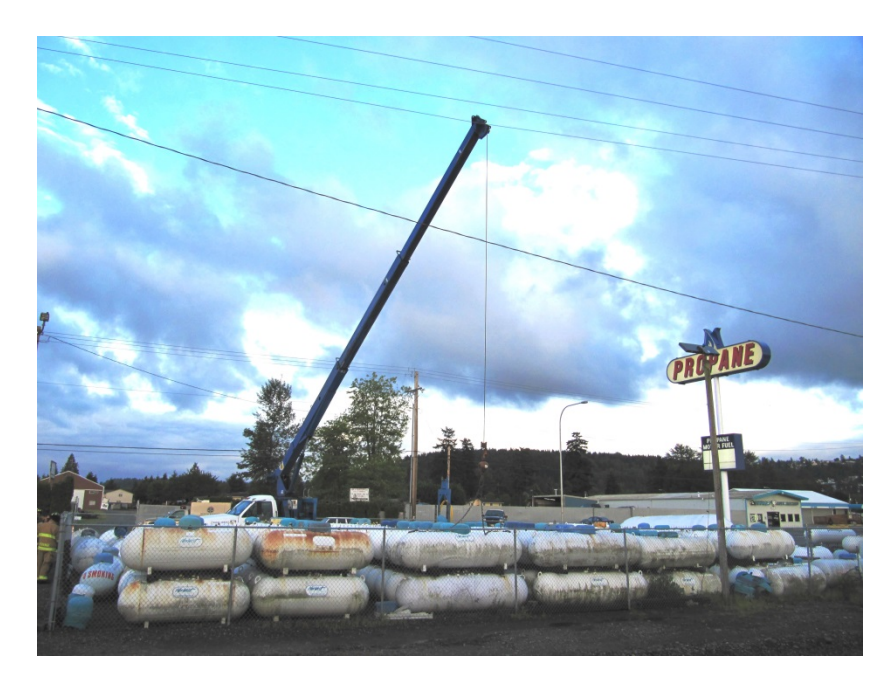
Photo 4. Incident site showing the employer's propane tank storage yard with 320-gallon capacity propane bulk storage tanks that the victims were inventorying. The photo was taken after the crane boom made contact with the energized 7,200 volt power line.