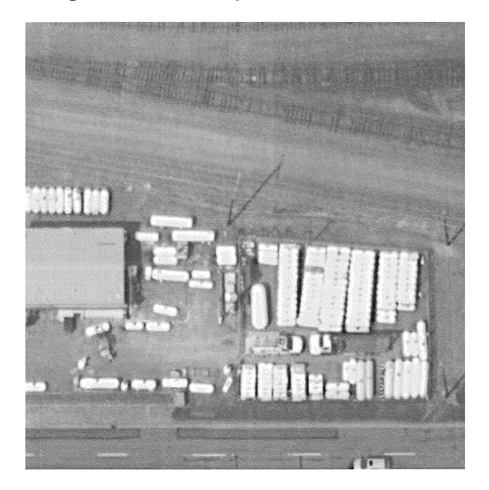
Photo 5. Aerial view of the north end of the employer's service center's propane tank storage yard where the incident occurred. This photo was not taken at the time of the incident, but shows the yard's general configuration.

Photo 4. Incident site showing the employer's propane tank storage yard with 320-gallon capacity propane bulk storage tanks that the victims were inventorying. The photo was taken after the crane boom made contact with the energized 7,200 volt power line.