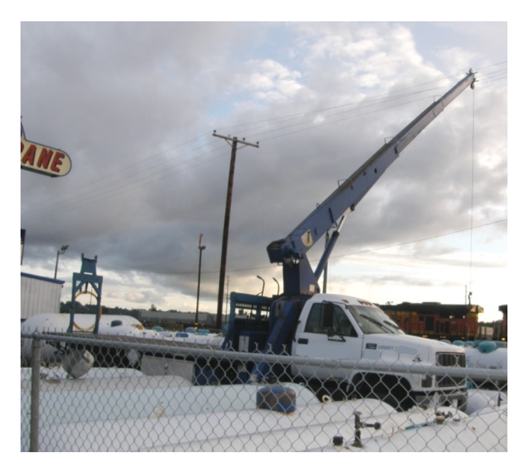
Photo 1. 8-ton boom truck crane with telescopic boom extended at incident site in employer's propane tank storage yard.

The boom truck crane was used to lift and move propane tanks in the company yard. It was also used to lift, move, and install propane tanks at customer locations. With a heavier lift capacity and a longer boom than most of the company's boom truck crane fleet, this crane was used for specific customer needs, such as large tank delivery. It had previously been used during the company's annual tank inventory at its tank storage yard, including in the area where the fatal incident occurred.