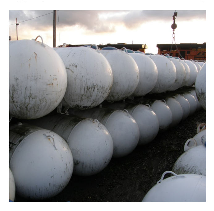
Photo 7. Incident scene showing stacked rows of propane bulk storage tanks being inventoried by the victims. View is from ground level near the boom truck looking toward the tank rigged by the material handler.

Photo 6. 320-gallon capacity propane bulk storage tank the material handler had rigged prior to the crane boom contacting the overhead power line.