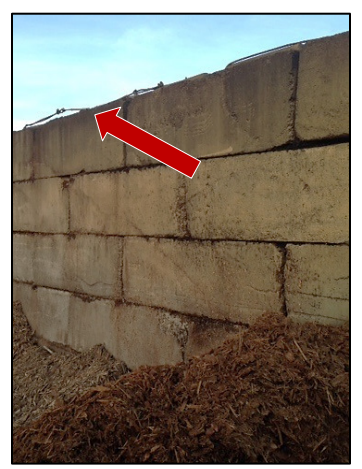
Photo 3. Steel cable threaded through ecology block picking eyes at top of wall