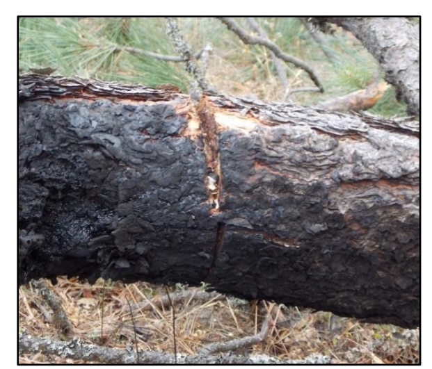
Photo 4 : Top and bottom cuts on tree at location where electrocution occurred

Investigators later found that the victim had made one cut without incident through the tree approximately 11 feet from the base of the tree in his attempt to remove the tree from the power line. When the tree remained