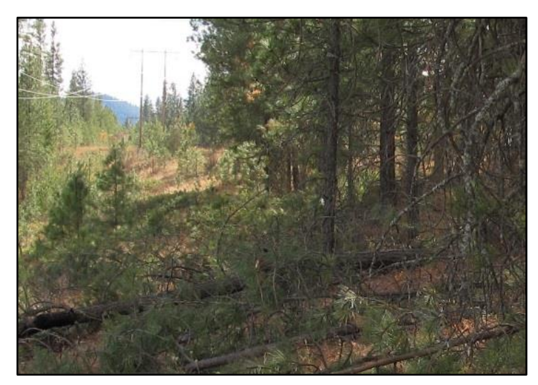
Photo 2 : Tree felled by victim, showing stand of trees and power lines.

The victim was working falling trees within the stand adjacent to the road at the top of the slope (photo 2). His partner was working with his back to the victim, bucking the trees felled by the victim into smaller pieces. After finishing cutting one tree into sections, the victim's partner turned and noticed the top of a