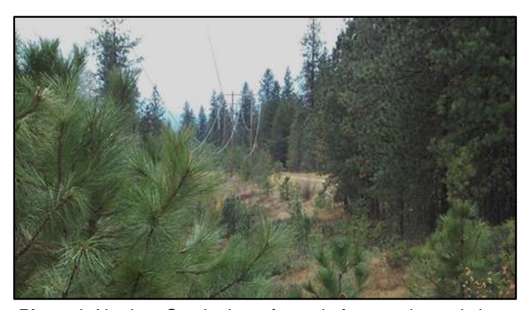
Photo 1 : North to South view of stand of trees where victim was working and proximity to power lines.

The weather at the time of the incident was dry and overcast. There had been little rain in the area in previous days.