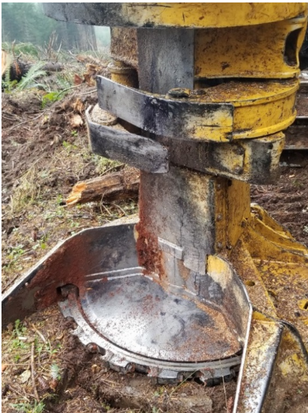
Photo 1. Bunching head used in incident