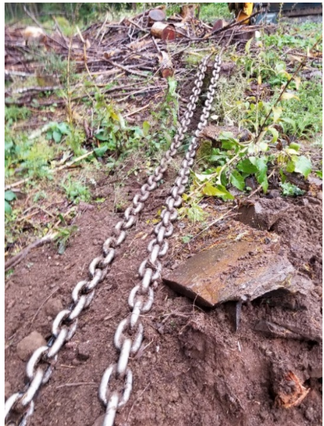
Photo 2. Chains hooked to tether machine

Prepared by WA State Fatality Assessment and Control Evaluation (WA FACE) program. WA FACE is supported in part by a grant from the National Institute for Occupational Safety and Health (NIOSH grant 2U00H008487).