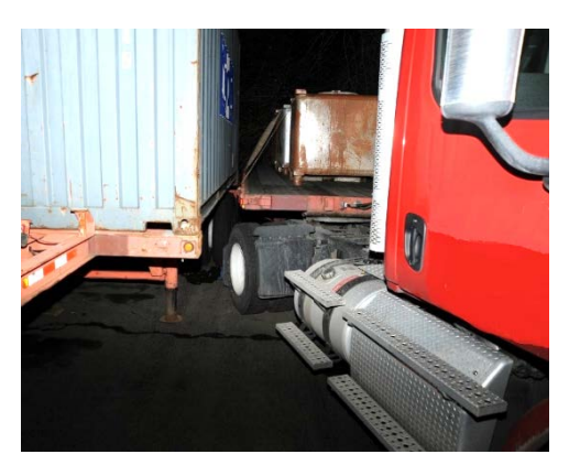
Pinch point between the two trailers where the truck driver was crushed when his semitruck and trailer rolled backward.

He got out and hooked up the trailer to his truck. He did