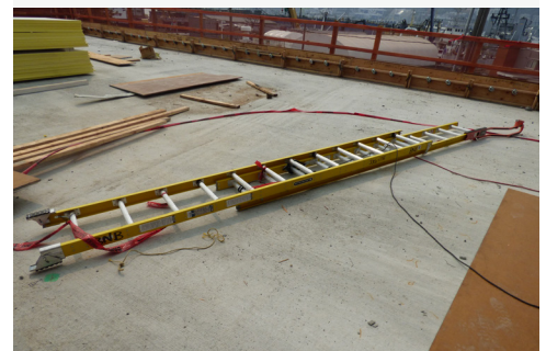
Figure 3: The extension ladder that the foreman fell from. Only one rail extension was attached at the time of the incident.