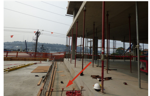
Figure 2: The red arrow points to where the foreman landed on his feet near a row of covered vertical rebar.