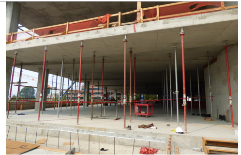
Figure 1: Area where the workers placed the extension ladder.

Then, flip the page over for contributing factors and safety recommendations and requirements.