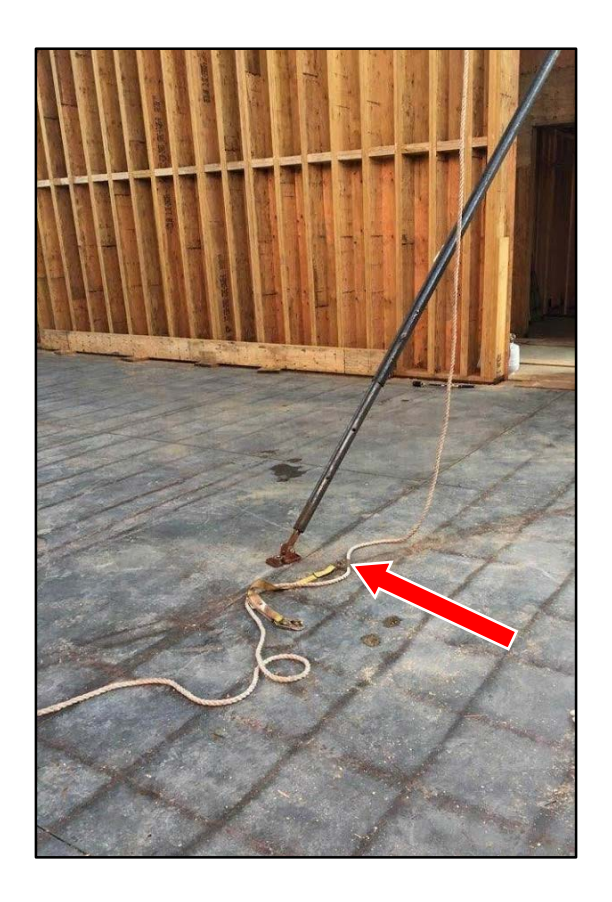
Photo 2 . Incident location with the rope grab (arrow) showing slack in the lifeline.