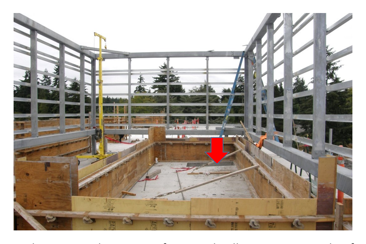
Photo 2. Incident scene showing rooftop windwall structure, wooden form for a concrete stem wall to support to support an HVAC unit, and the location where the ironworker jumped down from the form onto the hole cover.