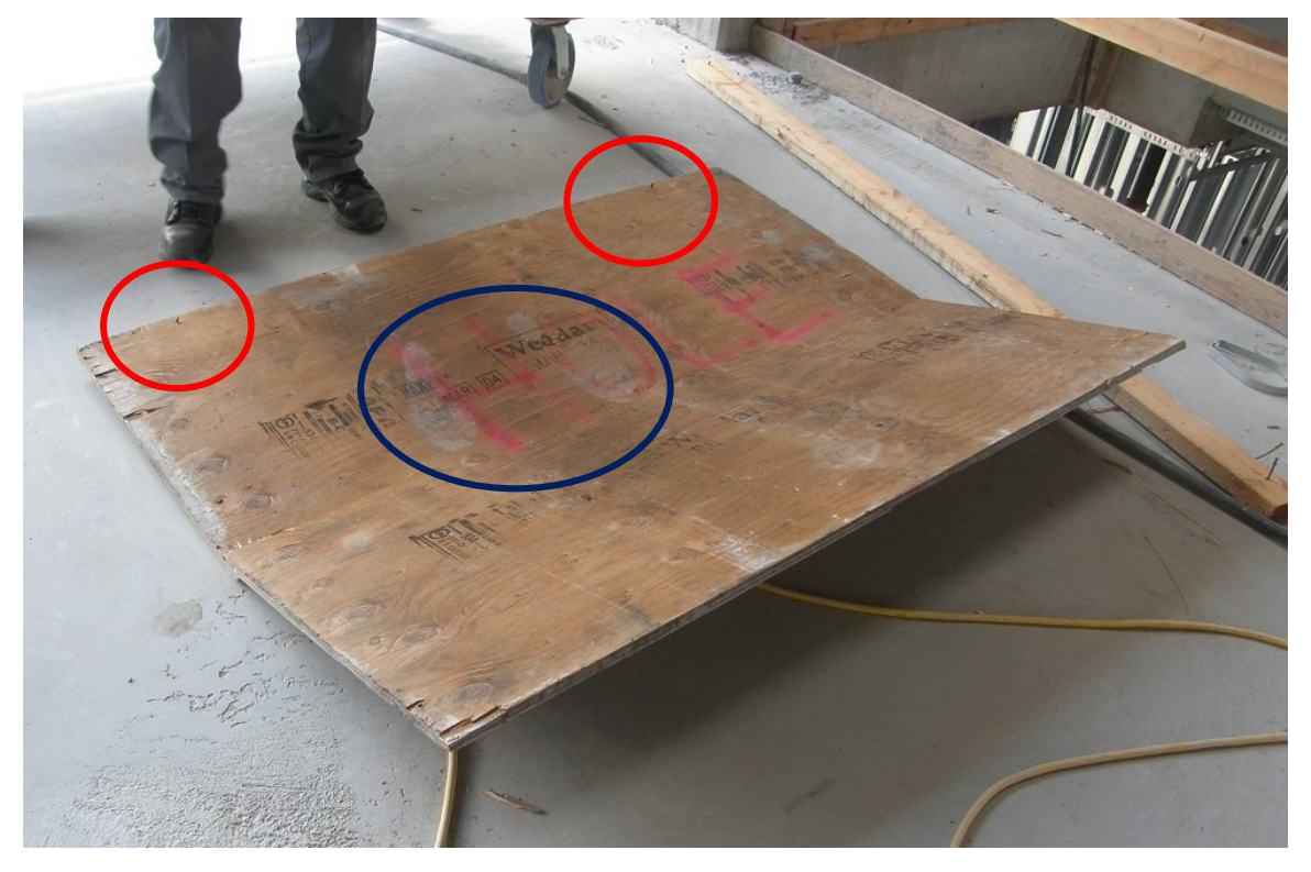
Photo 5. Plywood hole cover that failed with the word "HOLE" painted on it. Two nails that secured the cover to the stub wall sill are indicated by red circles. The ironworker's boot prints are indicated by the blue circle.