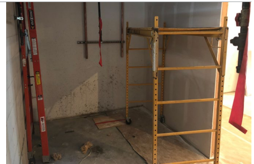
Photo 1: Six-foot mobile scaffold set up in the small mechanical room. The room's door is to the right of the scaffold.

Then, flip the page over for contributing factors and safety recommendations and requirements.