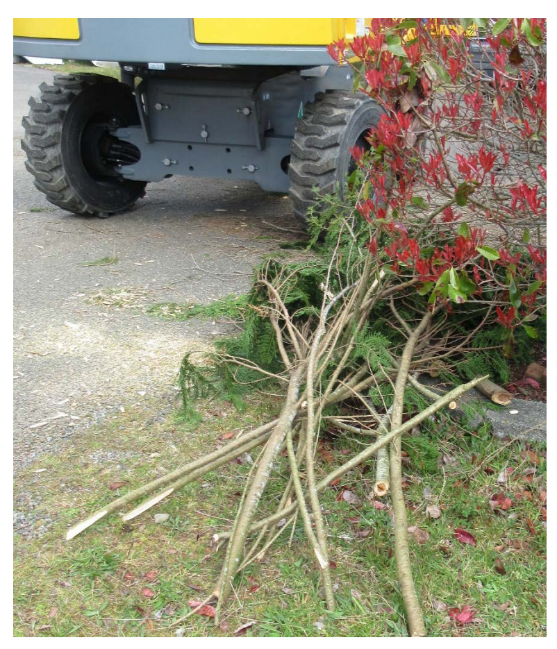
Photo 10: Some of the smaller limbs that the workers collected into the boom lift basket.

The remains of the cut limbs on the tree indicate that some of the limbs they had cut may have been several inches in diameter. This may have made the limbs difficult to bring into the basket. Some of the smaller limbs can be seen in photo 10. There is no evidence that the boom lift basket moved or shifted prior to the operator falling.