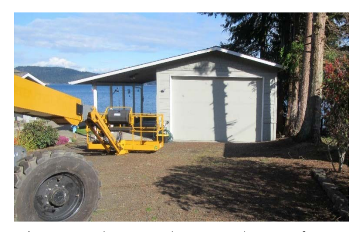
Photo 2: Incident scene driveway and garage of residence. Workers were in the boom lift basket limbing trees on the right side of the garage.