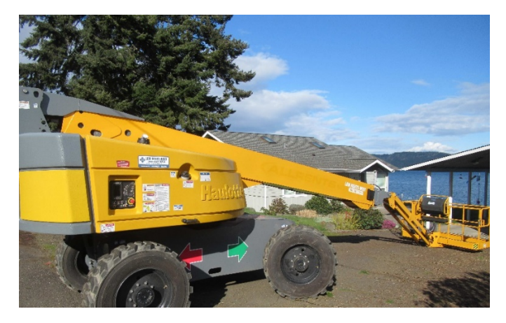
Photo 1: Incident scene driveway of residence with boom lift that workers were using to limb trees.

The job was initially contracted between the owner of the home and a logging company. That company then subcontracted the job to the employer who owned a small tree removal and landscaping company. The crew consisted of the company owner, the boom lift operator, and another worker. The three had worked together doing similar jobs in the past. According to the employer, he hired the operator because he knew he had experience operating the boom lift.