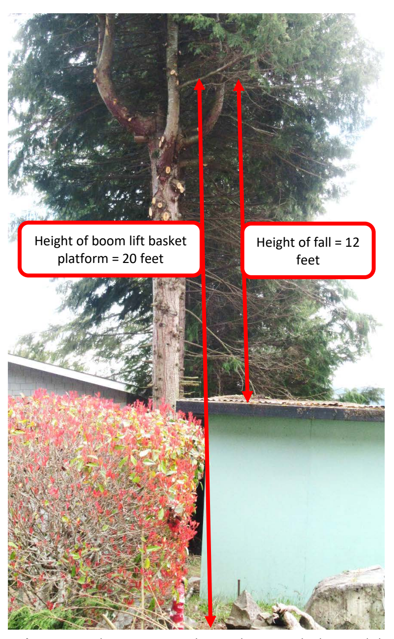
Photo 9: Incident scene tree that workers were limbing and shed that operator fell onto. Red arrows show approximate location and height of boom lift basket and operator's operator fall.