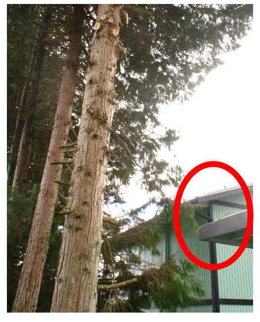
Photo 4: Tree that workers were in the process of limbing. The building on the right side of the tree is the adjacent residence. The roof of a small shed can be seen in the foreground (circled). The limb scars indicate that some of the limbs were several inches in diameter. Note the amount of space between the tree and the structures that would have allowed the crew to rig and lower cut branches to the ground.

The area where they needed to locate the boom lift basket to work was between the garage of the residence whose owner contracted the job and the home and shed of the adjacent residence. The shed was 8 feet tall and located in front of the garage (see photo 4). This meant they would need to position the boom lift basket above the garage and the shed in order to limb the trees.