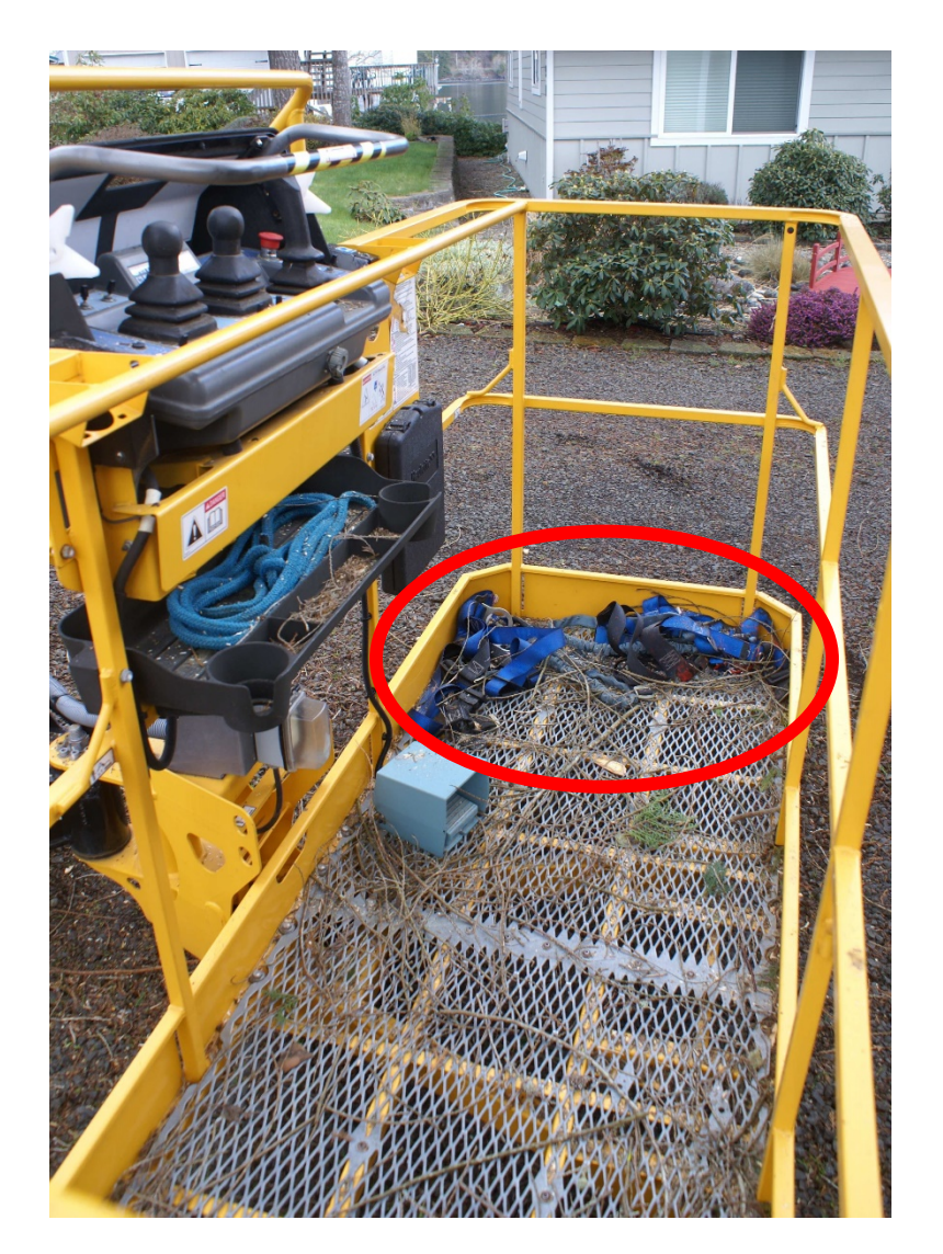
Photo 7: The two rented fall protection harnesses in the boom lift basket (circled). Also pictured are the control panel and the foot pedal that was required to be depressed in order to operate the basket.

They were wearing hard hats, safety glasses, and safety boots so there was an awareness of and attention to safety hazards. It is unknown if they were using any other safety equipment at the time of the incident. They were not wearing their fall protection harnesses even though they were in the basket (see photo 7).