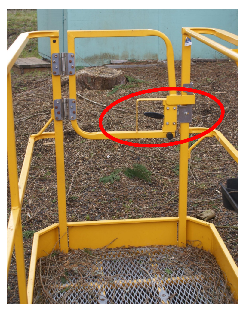
Photo 8: View of side access gate of boom lift basket. The gate had a mechanical latch (circled) and swung into the basket when opened. Note that the toe board is in place.

The coworker was cutting branches with his chainsaw while the operator was pulling the branches into the basket. They were doing this for approximately an hour. The operator opened the side access gate of the basket (see photo 8) in an attempt to get some branches into the basket. The coworker said he was reaching down to pick up his chainsaw when he saw the operator fall from the basket onto the roof of the shed 12 feet below (see photo 9). It is unknown if the operator was leaning outside of the basket and lost his balance while trying to maneuver limbs into the basket or tripped over branches in the basket or the toe board.