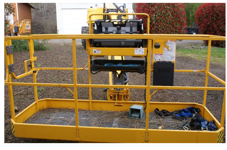
Photo 6: View of front of boom lift basket. The basket had a capacity rating for two workers or a maximum of 500 lbs.

Shortly after arriving on site, the operator and his coworker entered the basket (see photo 6). The operator controlled the boom lift from the basket and elevated it to approximately 20 feet above the ground where they could reach the lower limbs of the tree. The bottom of the basket was approximately 12 feet above the roof of the shed. They decided they needed to pull the cut branches into the basket to keep them from falling and damaging the roof of the garage and the shed. The company owner remained on the ground to operate the chipper.