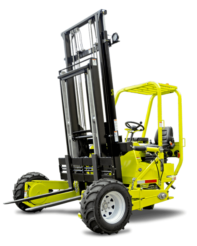
Photo 5 . Truck-mounted, three-wheel drive forklift similar to incident forklift.