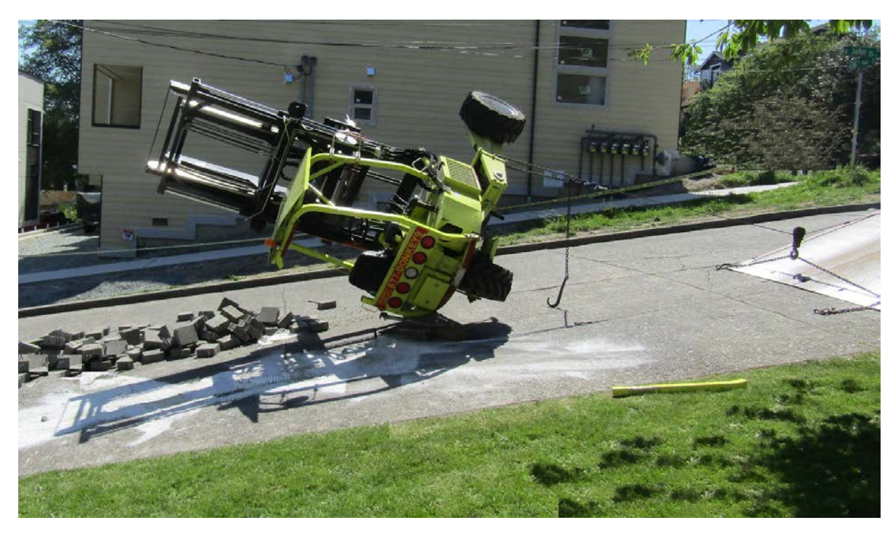
Photo 4. Forklift at incident scene being loaded onto tow truck flatbed.