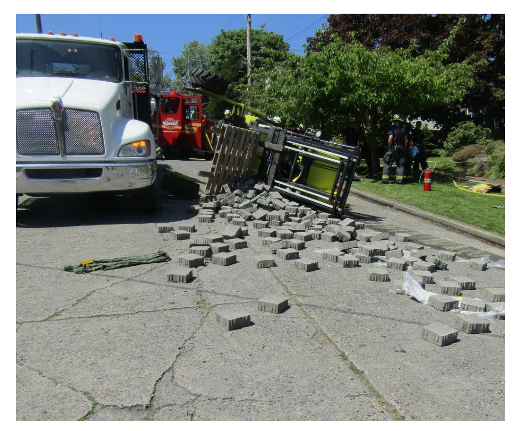
Photo 2 . Overturned forklift showing city street slope and surface.