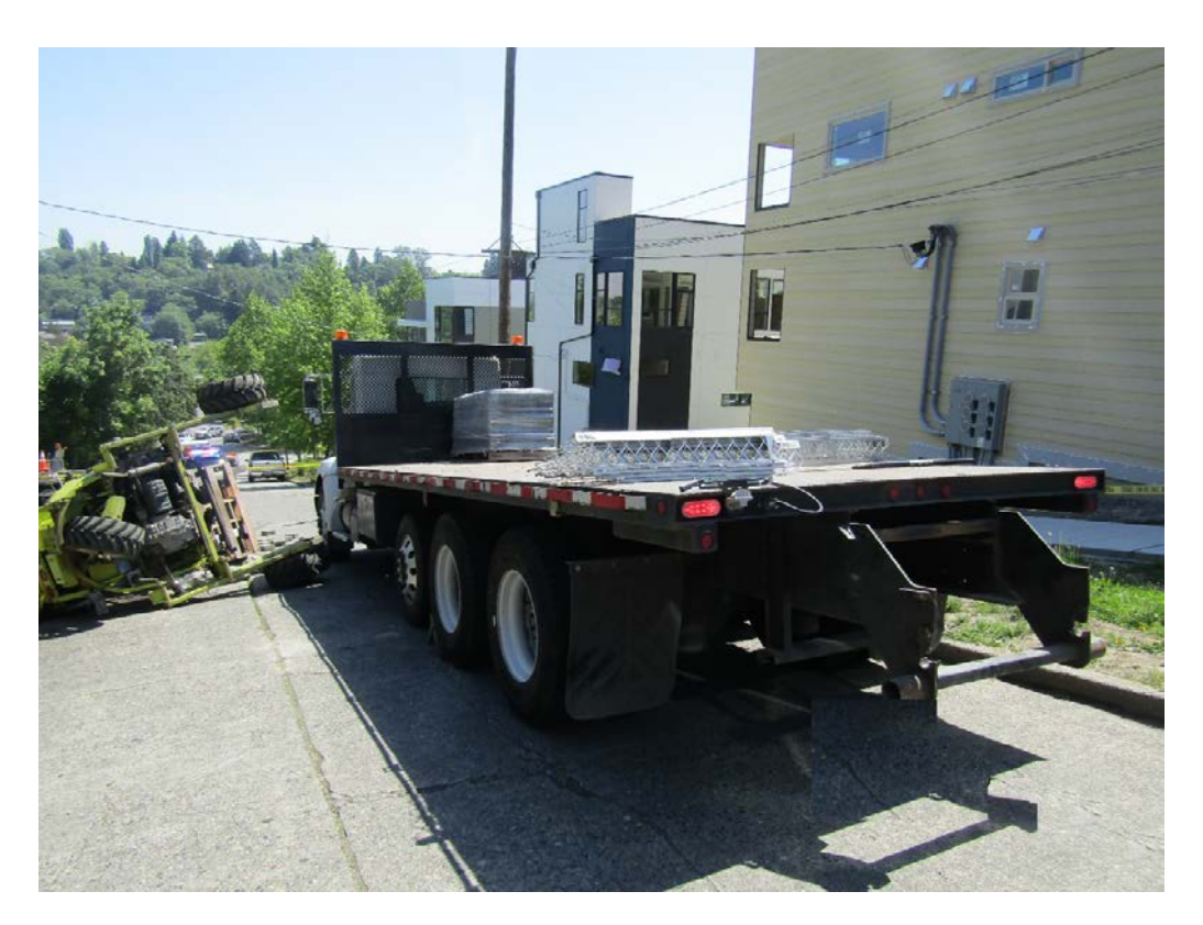
Photo 3 . Delivery truck with overturned forklift on city street. The driver was using the forklift to lift a pallet of paving blocks from the flatbed when the forklift overturned.