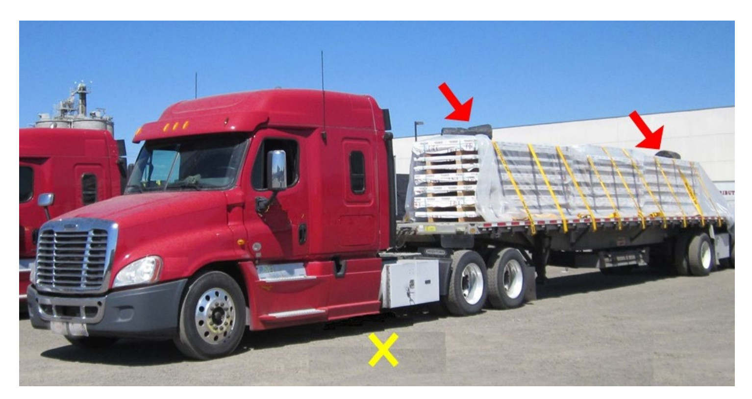
Photo 1 . Front view of semi-truck with flatbed trailer at incident scene. After falling from the trailer on the passenger side, the injured driver got up, walked around the front of the tractor, climbed into the cab, and, while exiting the cab, fell again to the ground where he was found. Red arrows show locations of tarps placed on load. Yellow X shows where driver was found.