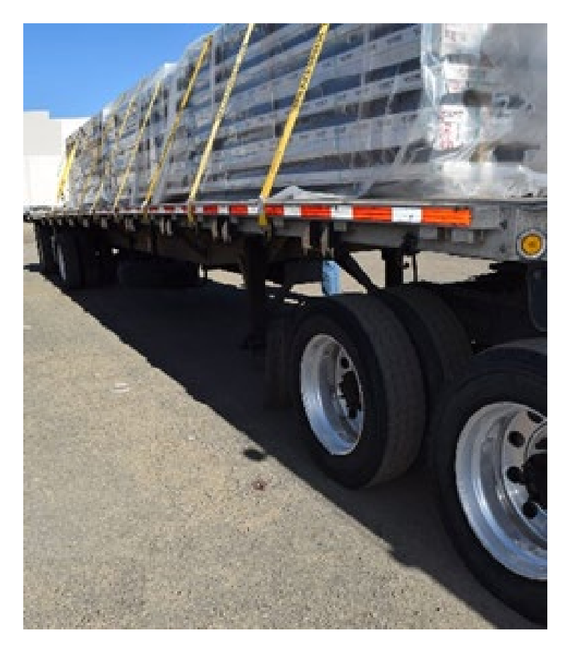
Photo 2 . View of flatbed trailer's passenger side where the driver fell while tarping load of sheet aluminum. The driver fell around 51 inches from the deck to the ground below.