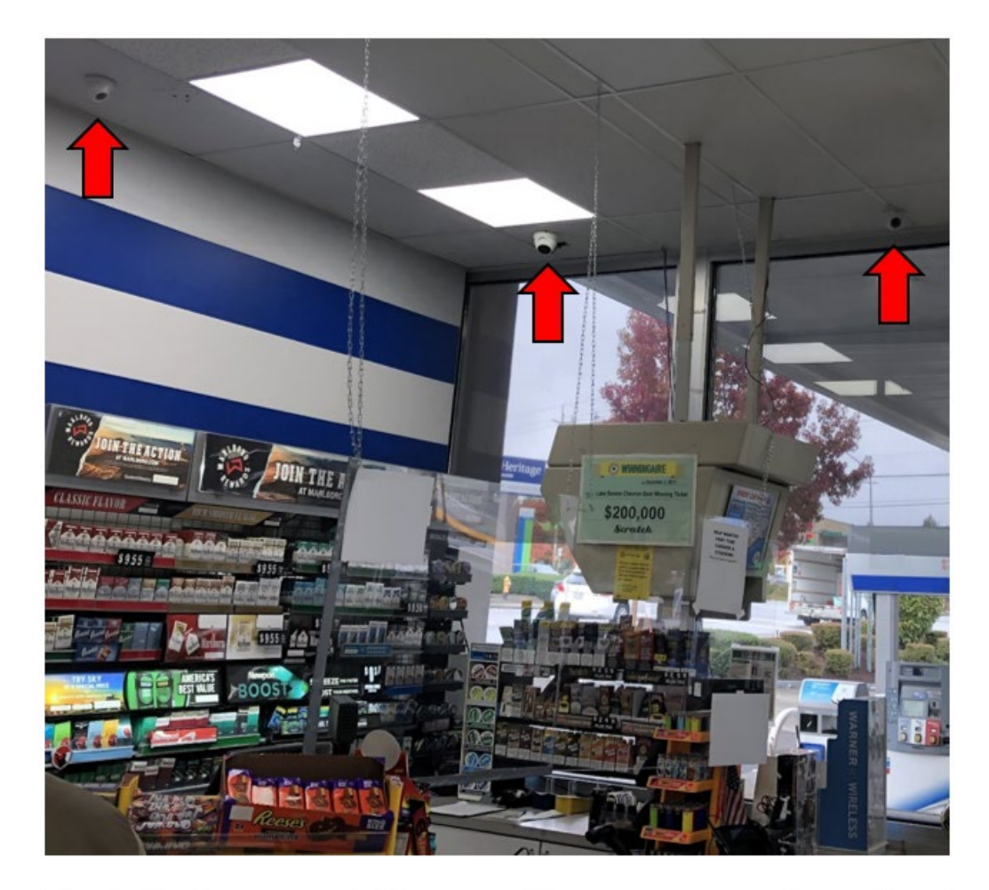
Photo 3 . Arrows point to surveillance cameras above front counter area where shooting occurred.