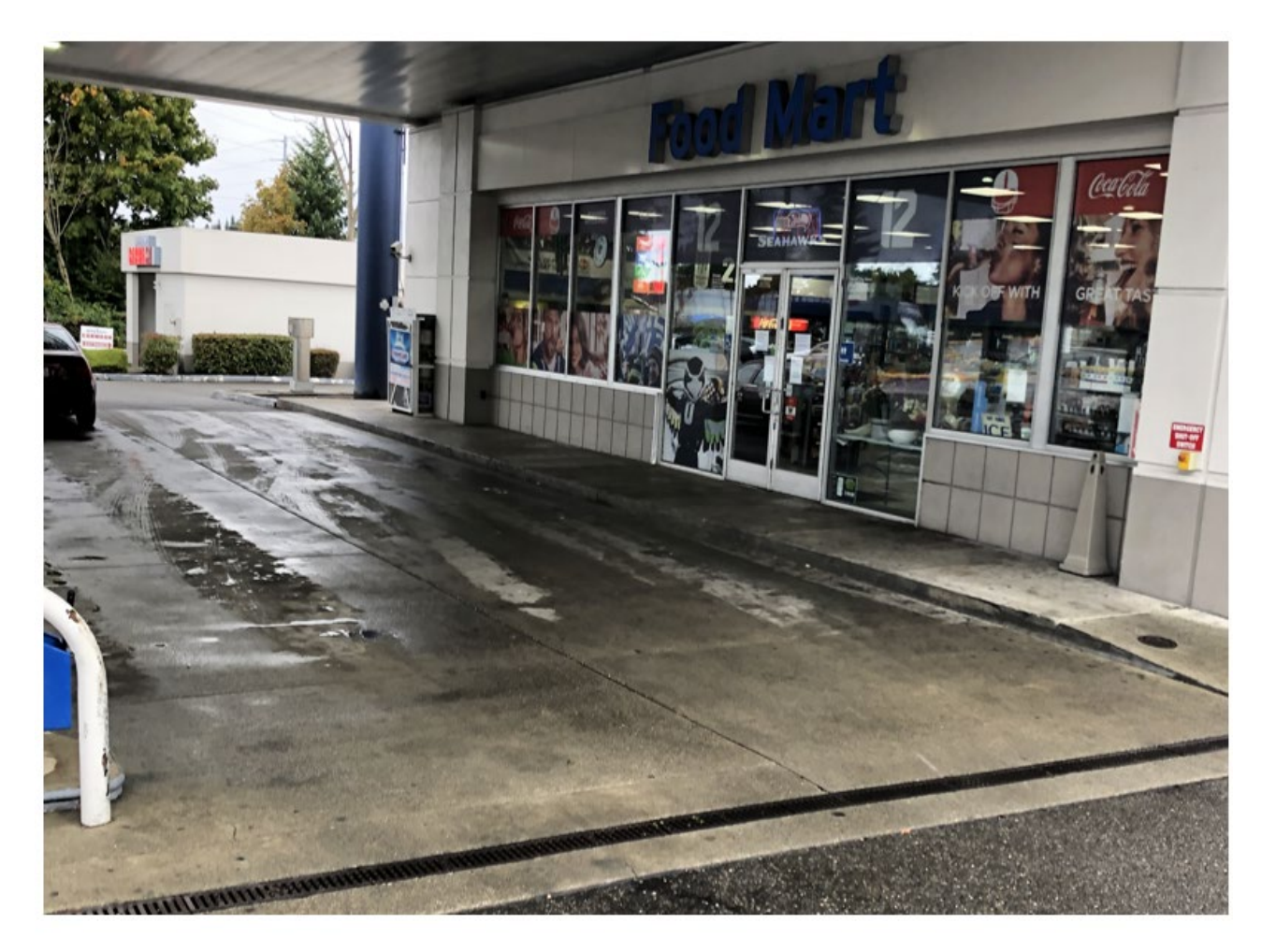
Photo 1. Front entrance of gas station food mart where gunman entered.