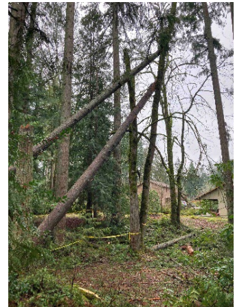
Storm-damaged fir trees leaning against maple tree the trimmer was cutting when he died.