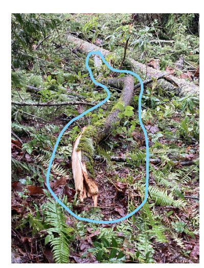
Broken limb that dislodged, fell, and struck the trimmer in the forehead.

got hung up in the canopy without anyone noticing. The limb was 14-feet long, around four-inches thick, and weighed between 70 to 100 pounds. While doing the back cut, the maple formed a vertical crack that dislodged the broken limb. When the trimmer looked up toward the sound of the crack, the limb fell straight down, striking him in the forehead. A crewmember called 911 and began CPR until first responders arrived and pronounced the trimmer dead at the scene.