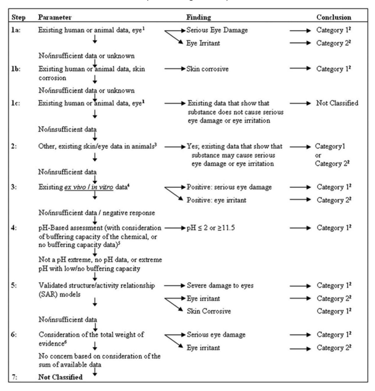
Figure A.3.1 Evaluation strategy for serious eye damage and eye irritation (See also Figure A.2.1)

A.3.3.4 All the above information that is available on a substance must be evaluated. Although information might be gained from the evaluation of single parameters within a tier, consideration must be given to the totality of existing information and making an overall weight of evidence determination. This is especially true when there is conflict in information available on some parameters.